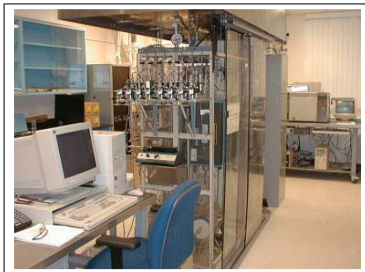
CETC-Ottawa's Membrane Testing Facilities

With commercial success, this technology will open up an entire new market for ceramics in the area of industrial production of synthesis gas, hydrogen and hydrocarbon processing.