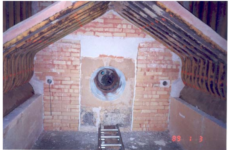
A Furnace Enclosure of a Small Boiler