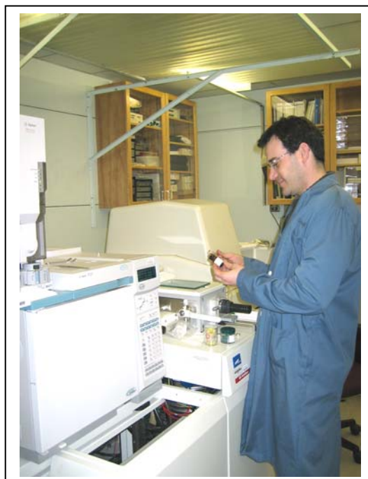
A gas chromatograph equipped with a high-resolution mass spectrometer (HRGC/MS)

With active involvement in standards development and research into novel analytical techniques and methodologies, the Characterization Laboratory strives to meet the unique needs of the energy technology R&D programs.