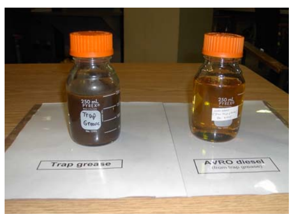
Waste grease (left)

The process combines mild thermal cracking with esterification. This process is being patented by the CANMET Energy