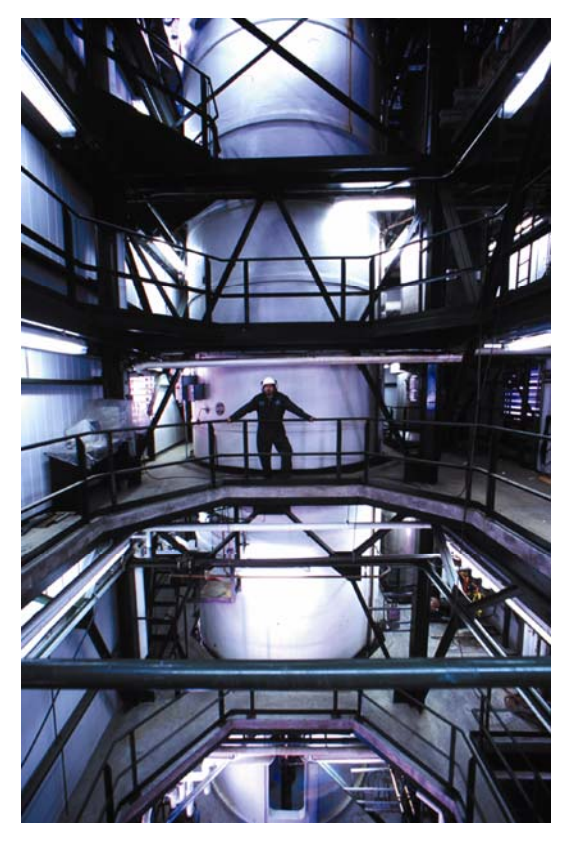
logen Corporation Fermentor

CETC-Ottawa is proud of its role in moving ethanol-from-waste out of the laboratory and into the marketplace.