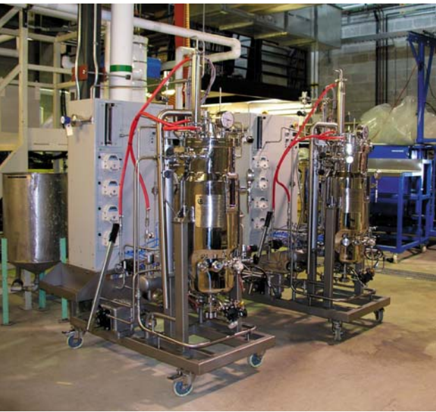
University of British Colombia Plant

179 million litres of fuel ethanol are produced in Canada each year from cereal grain and corn. With the addition of new production plants currently under construction, this is expected to increase to 1.2 billion litres over the next few years.