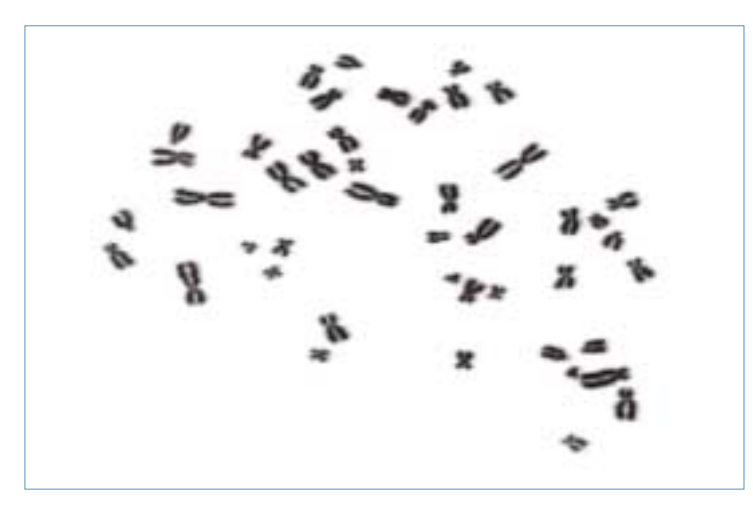
Normal chromosomes form an X and the centromere is at the centre

Radiation causes many biological effects including specific damage to chromosomes. In humans, normal cells contain 23 pairs of chromosomes, each with a single centromere.