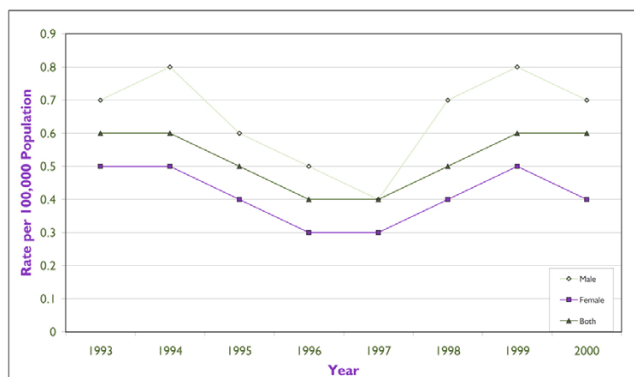
Figure 6 Reported Infectious Syphilis Rates in Canada

males to have been forced into their first sexual encounter[49]. Men have more control than women over condom use. Women are uncomfortable about insisting on condom use for fear of the reactions of their male partners regarding trust and commitment issues[50,51]. The power differential and potential for domestic violence create barriers that may prevent women from protecting themselves[52]. Therefore, prevention programs for women need to target safer sex negotiation skills and female-controlled methods[53,54].