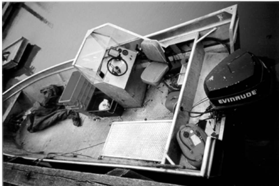
Overview showing fish crates