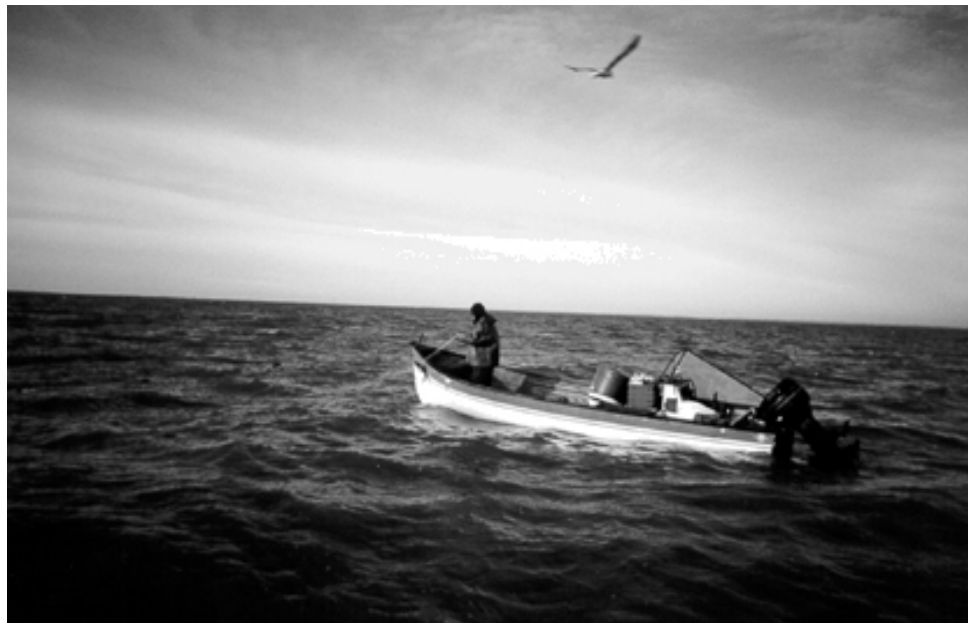
A fisher gill netting.