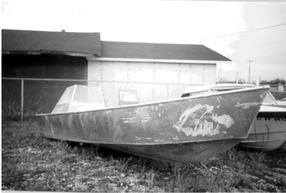
A Lake Winnipeg yawl similar to the occurrence vessel