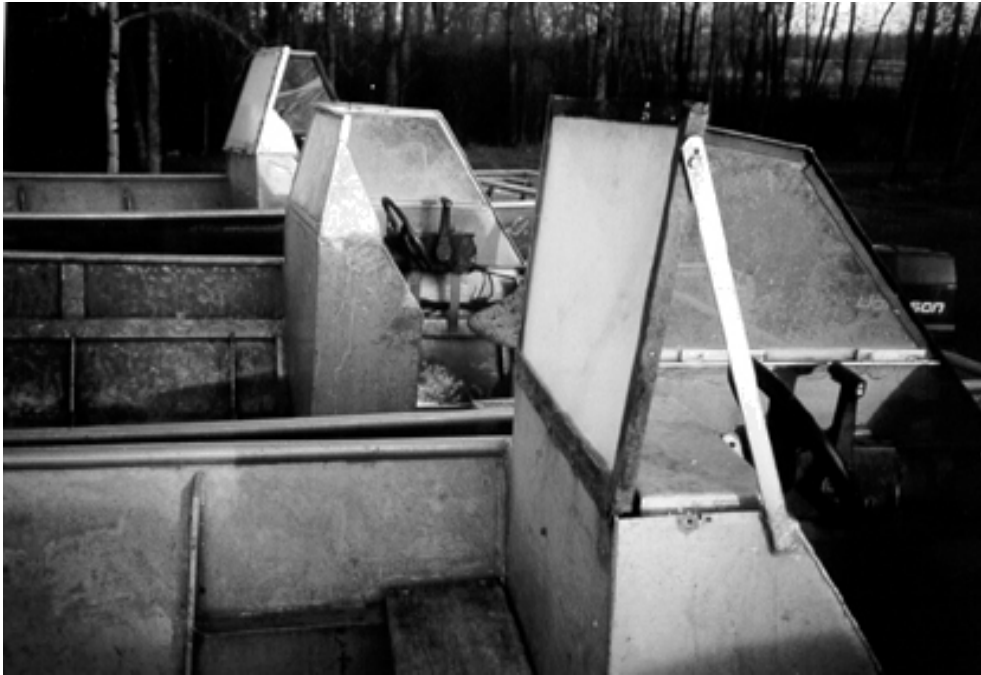
Typical split-console engine control station