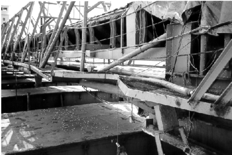
Unloading boom catwalk: damage from contact with light standards