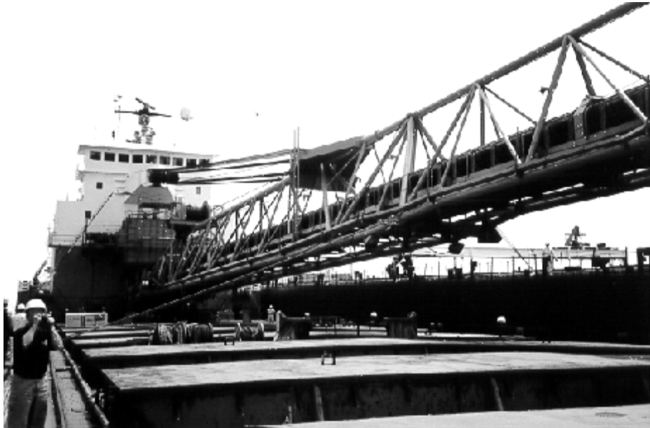
Unloading boom in topped-up position