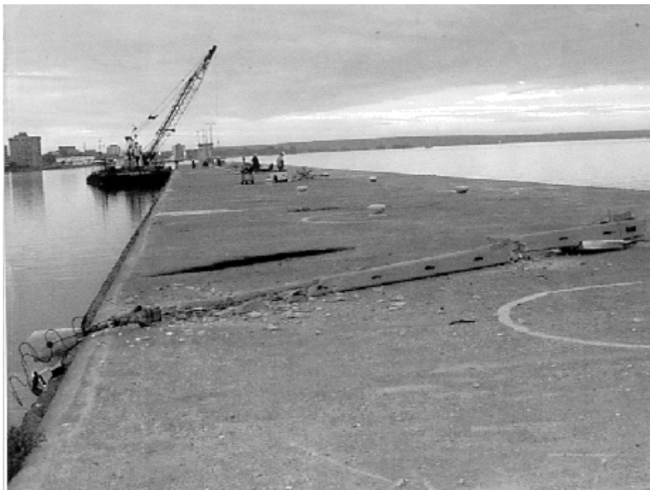
Damaged light standards on dock