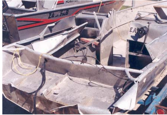
Photo 3. Damaged Shannon Dawn

The Shannon Dawn was found with the tip of the bow projecting above the surface of the water, which tends to support a “capsizing settling by the stern” scenario. When the vessel was recovered, it was missing its motor. It is suspected that the motor was ripped off the transom when the Shannon Dawn passed over the first set of shoals at the southwestern tip of Berens Island. The vessel then drifted approximately one mile further. Any ingress of large volumes of water would create a dangerous “free-surface effect” and significantly reduce the Shannon Dawn’s stability. The bilge pump was missing and had been reported as being non-operational. Consequently, shipped water could not be discharged from the vessel. In the heavy rolling sea with cresting waves, the free-surface effect of the entrapped water on board would have contributed to the capsizing action.