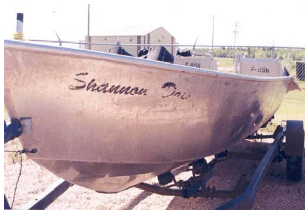
Photo 1. Port bow view of Shannon Dawn

The Shannon Dawn was constructed from plans used by several area manufacturers. The plans were shown to Transport Canada inspectors, but due to the vessel size, were not subject to the Transport Canada plan approval process. The manufacturer of the vessel estimated that 300 to 400 vessels of similar design have been built by the facility. The vessel incorporated a hard chine and side plating, with a pronounced flare toward the bow. There was a breast plate