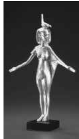
Selkis, one of the four goddesses who protected the gold shrine that held Tutankhamun's canopic jars