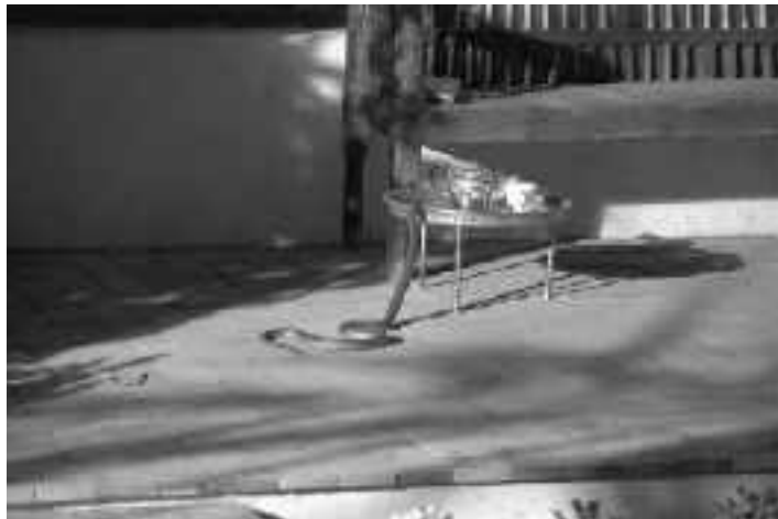
The cobra slithers over the floor and up a bench on its way to the canary's cage. Re-enactment scene from the film Mysteries of Egypt . CMC ECD98-026 #10

During the recent excavations which led to the discovery of the tomb of Tutankhamen, Mr. Howard Carter [the discoverer] had in his house a canary which daily regaled him with its happy song. On the day, however, on which the entrance to the tomb was laid bare, a cobra entered the house, pounced on the bird, and swallowed it. Now, cobras are rare in Egypt, and are seldom seen in winter; but in ancient times they were regarded as the symbol of royalty, and each Pharaoh wore the symbol upon his forehead, as though to signify his power to strike and sting his enemies. 19