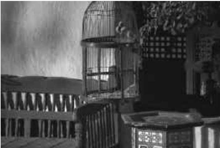
Carter's golden canary in its cage at the archaeologist's residence. Re-enactment scene from the film Mysteries of Egypt . CMC ECD98-026 #8

journalists suggested when reporting the story.