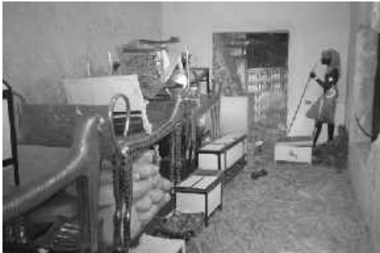
Royal beds, chests and round boxes of food were found in the antechamber of Tutankhamun's tomb. Robbers had left the tomb in a state of disorder. To prevent further intervention, priests resealed the tomb immediately after the robbers were discovered, without cleaning up the mess. Re-enactment scene from the film Mysteries of Egypt .