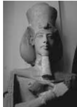
Statue of Akhenaten, who may have been Tutankhamun's father

his older half sister, became his queen. Tutankhamun ascended the throne in 1333 B.C., at the age of nine, and reigned until his death at the age of seventeen or eighteen. Some speculate that he was murdered, and others think he may have been deliberately sent into battle to be killed. However, the exact cause of his death is unknown. Those who believe he was murdered point to the hole in his skull as evidence, but some experts believe the hole was made after his death. His mummified body was so badly preserved that we may never know the true fate of this minor pharaoh.