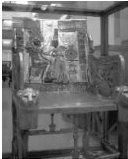
Tutankhamun's golden throne chair. The back of the chair bears an image of Tutankhamun and his wife.

The design of Tutankhamun's tomb is typical of that of the kings of the eighteenth dynasty. At the entrance to the tomb there is a flight of stairs leading to a short corridor. The first room is the antechamber, where many household items were found. Off this room is an annex, and at the far end is an opening that leads to the burial chamber. This chamber was guarded by two black sentry-statues that represent the royal ka (soul).