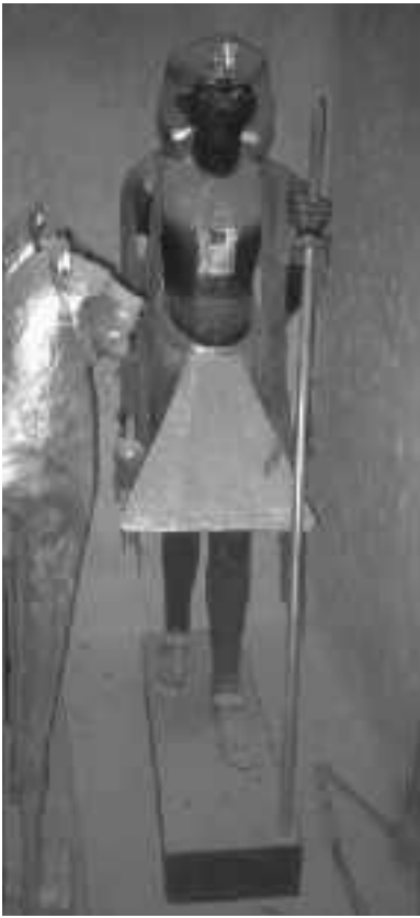
Inside the antechamber. One of two guardian figures that protected the entrance to Tutankhamun's burial chamber. Re-enactment scene from the film Mysteries of Egypt .