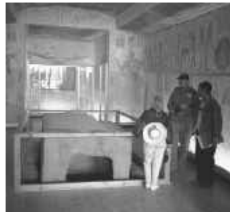
Inside the tomb of Ramses VII in the Valley of the Kings