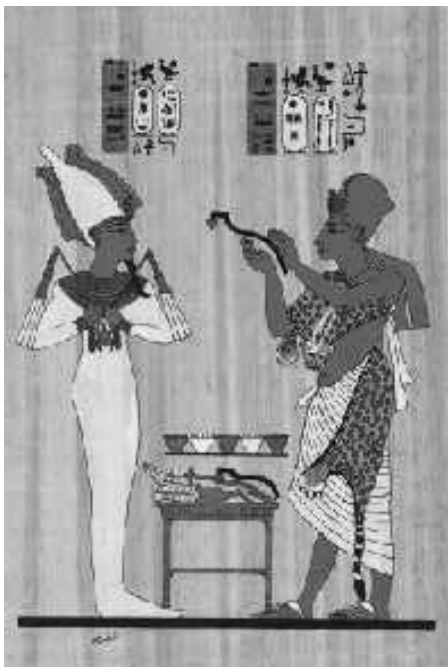
Ay (right) performs the "opening of the mouth" ceremony on Tutankhamun's mummy. Scene from Tutankhamun's burial chamber.

There were at least two other deaths following that of Tutankhamun. His young wife, Ankhesenamun, pleaded with the king of the Hittites to send her one of his sons for a husband. She did not want to marry a servant, such as Ay. A son was sent, but he was murdered before he arrived.