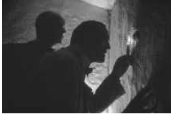
Howard Carter and Lord Carnarvon peer into Tutankhamun's tomb. Re-enactment scene from the film Mysteries of Egypt .