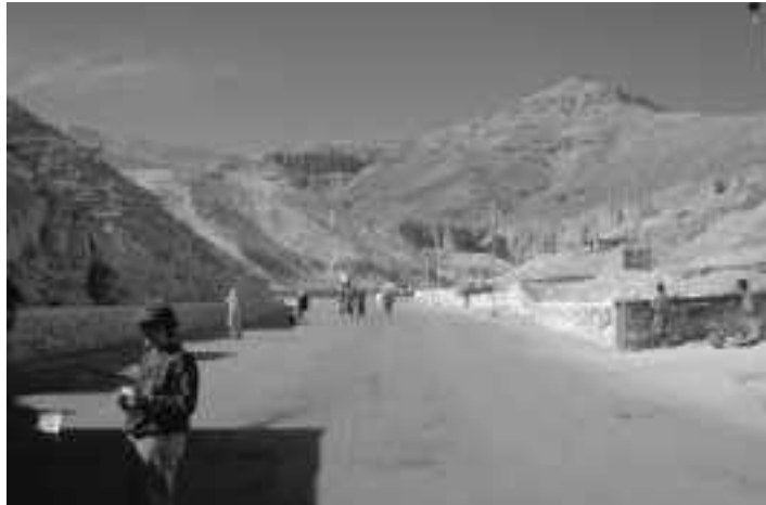
Road leading to the tombs in the Valley of the Kings. The Theban Peak can be seen in the background.

Tutankhamun is the best-known pharaoh of ancient Egypt. He was probably the son of Akhenaten, the heretic king of the eighteenth dynasty. His mother was probably Queen Kiya, one of the king's secondary wives. Ankhesenamun,