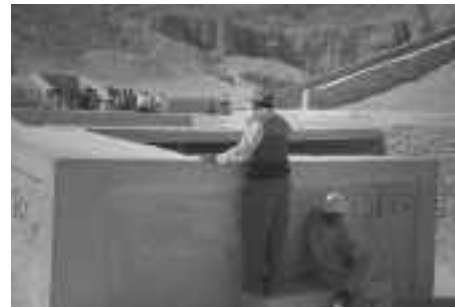
Entrance to Tutankhamun's tomb in the Valley of the Kings