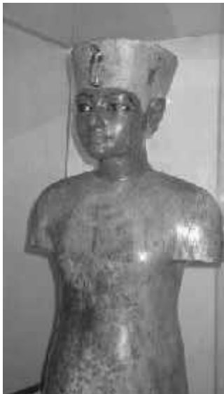
Bust of Tutankhamun found in his tomb

The tomb in which Tutankhamun was buried was probably intended for another person, but because of the young pharaoh's untimely death, it became his final resting place. Following the ritual "opening of the mouth" performed by his suc-