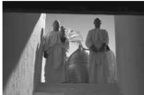
Priests lead the funeral procession taking Tutankhamun's coffin to his tomb. Re-enactment scene from the film Mysteries of Egypt .