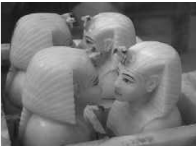
Tutankhamun's internal organs were placed in these canopic jars made of calcite (a translucent stone).

This famous quote sums up the excitement of this incredible discovery that took the world by storm. The awe-inspiring beauty of Tutankhamun's treasures has generated enormous interest in ancient Egypt.