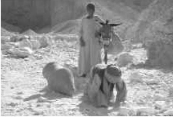
Howard Carter's water boy found the first step that led to Tutankhamun's tomb. Re-enactment scene from the film Mysteries of Egypt .