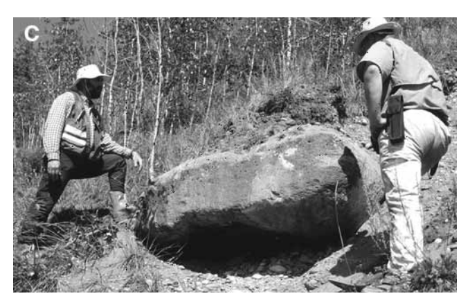
Figure 3. Large boulders found in glaciofluvial outwash gravel. A = quartz-mica gneiss with ptygmatically folded quartzose bands or veins; B = augen gneis; C = fresh vesicular olivine basalt

Brewer creeks (Fig. 2). To test the accuracy of these glacial limits, gravel was sampled along the lower reaches of Barker and Brewer creeks. Rocks exotic to the predominantly schistose Barker Creek basin (including abundant chert clasts) were found only in bench gravels at the mouth of Barker Creek at heights of up to about 34 m above Stewart River. Measurements of the imbrication of tabular clasts in these chert-bearing gravels indicate deposition by stream flow from the northeast down the Stewart River valley. This gravel changes facies within 2 km upstream along Barker Creek to a gravel containing no rock types from terrains to the east. Measurements of clast imbrication indicate that this gravel was deposited from the east to southeast. Mark Becker, a placer miner working claims in this area, noted that the facies change between chert-bearing and nonchert-bearing gravel is coincident with a change from nonproductive (chert-bearing) to auriferous (no chert) gravels along the historically placer-mined benches on Barker Creek (M. Becker, pers. comm., 1999). During traverses of the Brewer Creek basin northwest of Barker Creek, no erratic rock types were found in placer gravel along valley bottoms and along the drainage divide with lower Telford Creek.