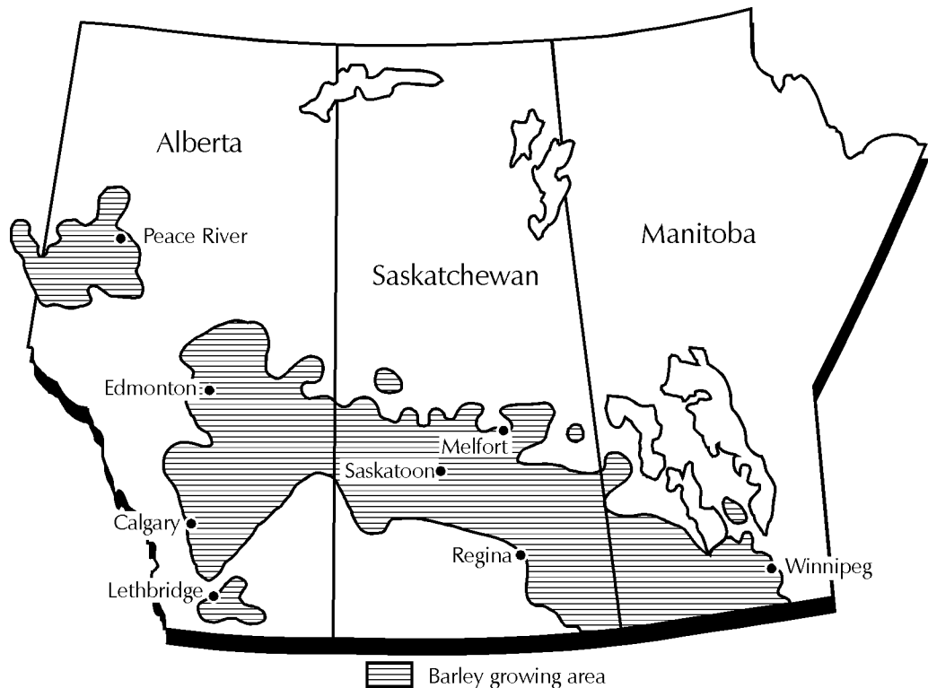
Figure 1 • Major barley growing areas in western Canada

Figure 1 shows the major barley growing areas in western Canada.