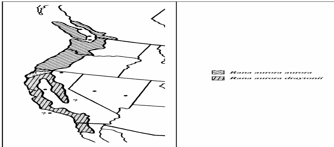
Figure 3. North American range of Rana aurora , from Stebbins (1985).