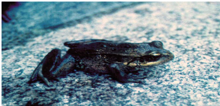
Figure 1. Adult Rana aurora , from Rush Creek near Nanaimo, B.C., July 1996.

Rana aurora tends to have a dark brown, gray, olive, or reddish back with many small, irregular, indistinct black spots and flecks (Fig. 1). The prominent dorsolateral folds tend to be lighter in colour, and there is a dark mask on the side of the face above a cream upper lip stripe. The throat and chest are white with black or gray flecks, and the skin on the lower belly and under the leg is bright red (the red colour appears to be under the surface of the skin). Juveniles have little or no red, and the red is more extensive on older frogs. There is a mottled green patch on the lower flanks, and the arms and legs are darkly barred. The skin of the lower leg is translucent so that the bones are visible, and webbing on hind feet does not extend to the last segment of the longest toe. The sexes tend to be difficult to tell apart, but the males have darkened thumbs during breeding, and enlarged forelimbs and webbing. Females can reach 100 mm, but males are usually less than 70 mm; both sexes are usually smaller in British Columbia. This species has relatively long legs; the heel of an adpressed hind limb reaches or passes the nostril (Nussbaum et al. 1983; Cook 1984; Green and Campbell 1984; Stebbins 1985; Leonard et al. 1993).