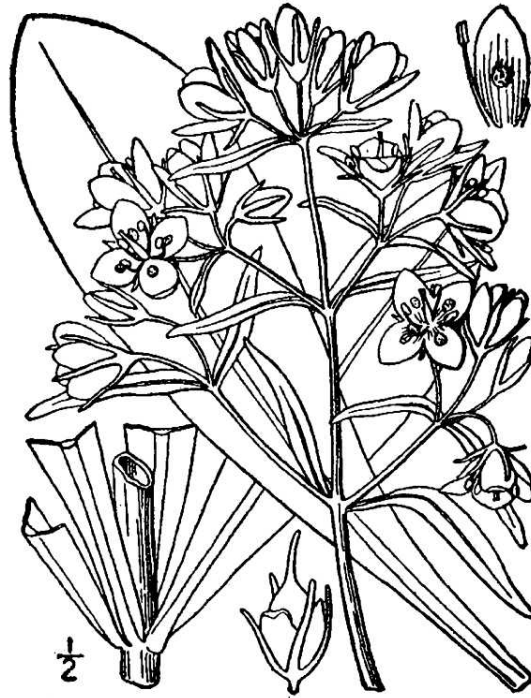
Figure 1. Frasera caroliniensis (Britton and Brown, 1913)