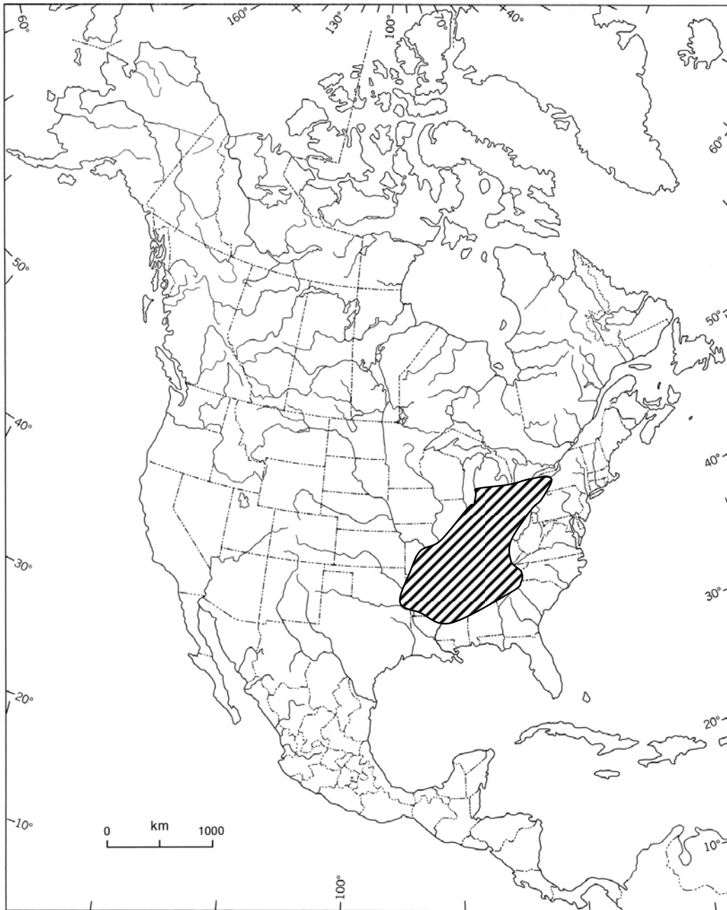
Figure 2. Global range of Frasera caroliniensis (after Crins and Sharp, 1993).