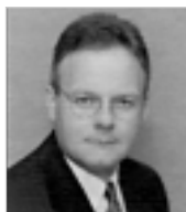
EDC's Stephen S. Poloz

Financial markets are taking their cue from these signs of economic encouragement. Most of the major stock markets are back up to August levels, and the major bond markets have retreated back to August levels. Also, the Canadian and Australian dollars, traditional bellwethers of the global economy, have both recovered from