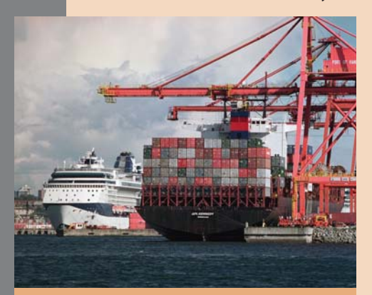
The Port of Vancouver handled more than 73 million tonnes of cargo in 2004.

Vancouver > On October 21, the Government of Canada released details of the Pacific Gateway Strategy, designed to enhance