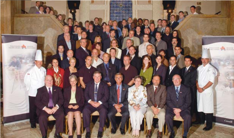
The Canadian delegation poses for an official group photo during the Team Canada Atlantic follow-up trade mission to Chicago.

Chicago, Illinois > Team Canada Atlantic (TCA), a partnership of federal departments and the four Atlantic Provinces, has once again organized a successful trade mission to the greater Chicago marketplace this past October. This mission built on the success and momentum established during the first mission that was held in April 2005.