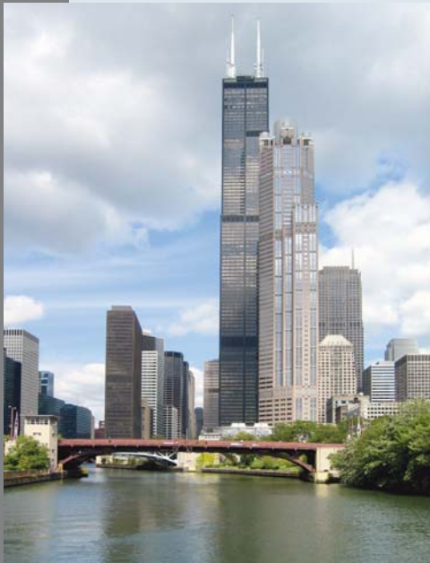
The unmistakable Sears Tower is located at the heart of Chicago's financial district.

Chicago is the commercial heartland of the U.S., with its strategic Midwestern location and vital transportation