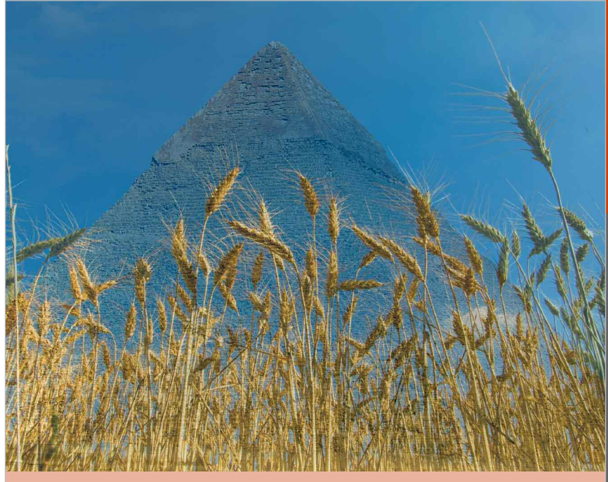
Wheat by the pyramides? Not likely, but it's no mirage that Canadian wheat sales to Egypt have skyrocketed this year.

To allay lingering worries over Canadian wheat, the embassy's trade commissioners