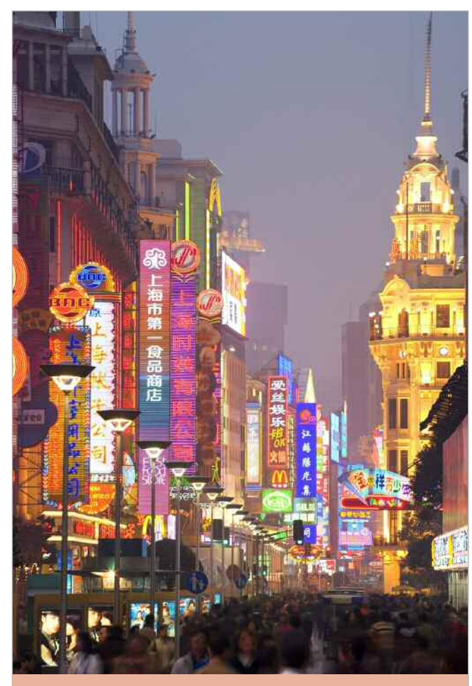
Canadians say China holds the greatest potential for exports and investment, according to a recent poll.

Regionally, there were differences in views about China. While Quebeckers were split on whether China or the U.S. holds more potential for exports and investment, the rest of Canada chose China over the U.S. by a margin of 18 percentage points. The gap in favour of China was even larger in western provinces, especially British Columbia, where 57% of respondents said China had the most potential, compared with only 18% who chose the U.S.