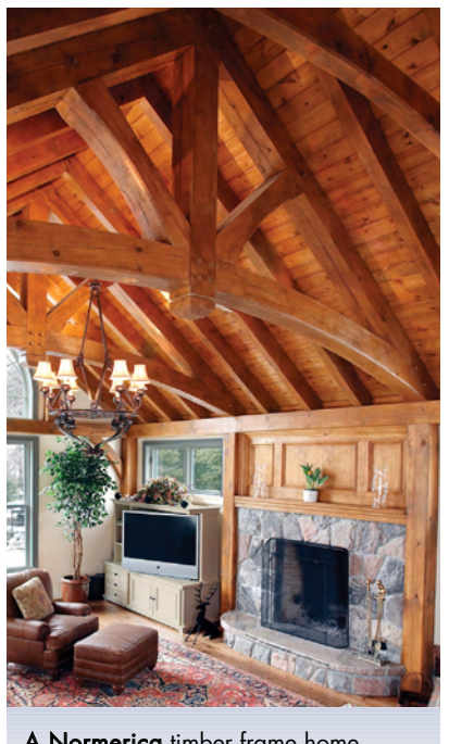
A Normerica timber frame home

The counties surrounding greater Washington, D.C., are some of the wealthiest in the United States. Fast-appreciating property values and low interest rates have provided homeowners in the region with the incentive to renovate their houses or build new custom ones. A Canadian company that specializes in massive handcrafted products has been busy helping.