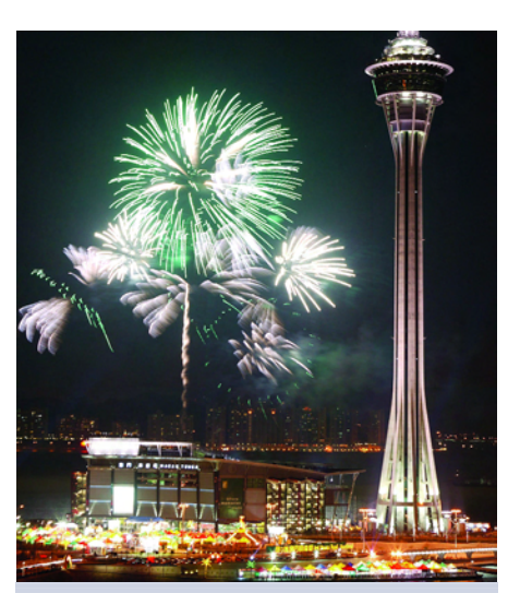
After becoming a Special Administrative Region of China in 1999, Macao enjoys a high degree of autonomy in all matters except national defence and foreign affairs.