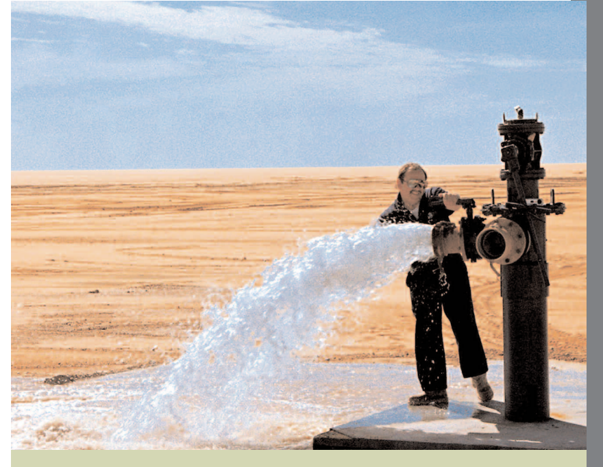
It's no mirage: SNC-Lavalin dug 700-metre-deep wells in the Saharan desert to tap Libya's aquifers. Opportunities abound for other Canadian firms.

In 2000, after early success in the U.S. market, Ontario-based Pressure Pipe