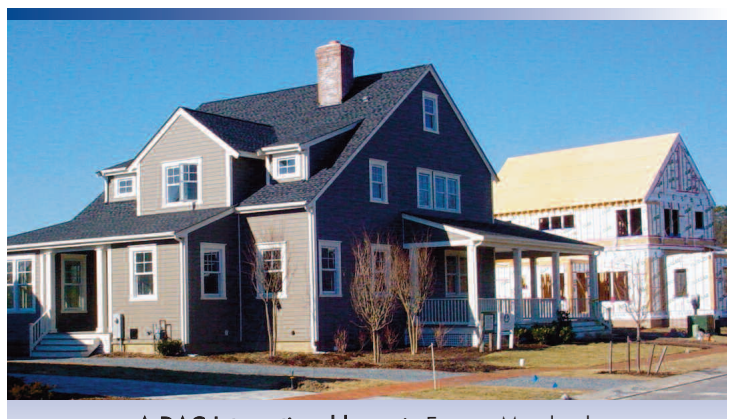
A DAC International home in Easton, Maryland.