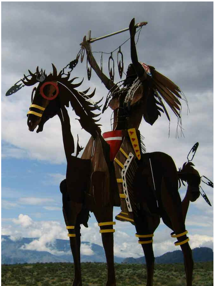
A sculpture graces the entrance to the Osoyoos Indian Band community in British Columbia. The Band's winery, Nk'Mip Cellars (pronounced in-ka-meep) is a joint venture with Vincor International.

"The Aboriginal business and international trade website will be an important tool in helping businesses make the most of global opportunities, particularly those emerging from the 2008