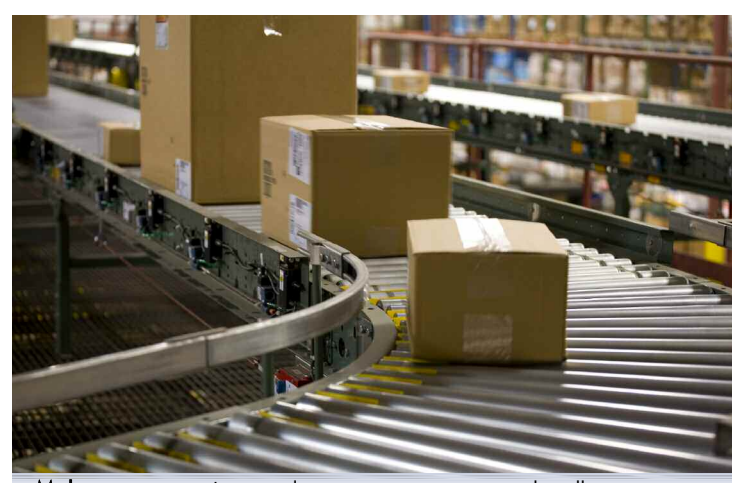
Make your move: Logistical success means getting a handle on your time, assets, movement and money.

There are many ways to move commodities, services and people in the modern world but not all options are appropriate for all situations. How an entrepreneur decides to "move" commodities (by rail, sea, air or road), services (in person, by telephone or over the Internet), or capital (by bank draft, wire