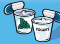
Yogurt 175 g (¾ cup)