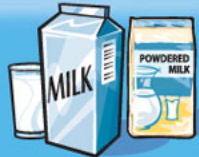
Milk or powdered milk (reconstituted) 250 mL (1 cup)