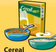
Cereal Cold: 30 g Hot: 175 mL (¾ cup)