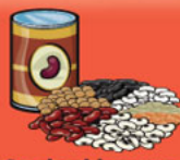
Cooked legumes 175 mL (¾ cup)