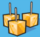
Cheese 50 g (1 ½ oz.)