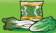
Leafy vegetables Cooked: 125 mL (½ cup) Raw: 250 mL (1 cup)