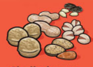
Shelled nuts and seeds 60 mL (¼ cup)