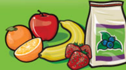
Fresh, frozen or canned fruits 1 fruit or 125 mL (½ cup)