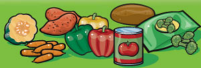
Fresh, frozen or canned vegetables 125 mL (½ cup)