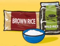
Cooked rice, bulgur or quinoa 125 mL (½ cup)