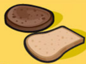
Bread 1 slice (35 g)