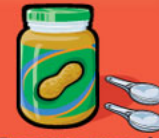
Peanut or nut butters 30 mL (2 Tbsp)