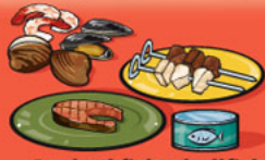
Cooked fish, shellfish, poultry, lean meat 75 g (2 ½ oz.)/125 mL (½ cup)