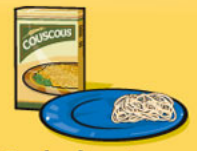
Cooked pasta or couscous 125 mL (½ cup)