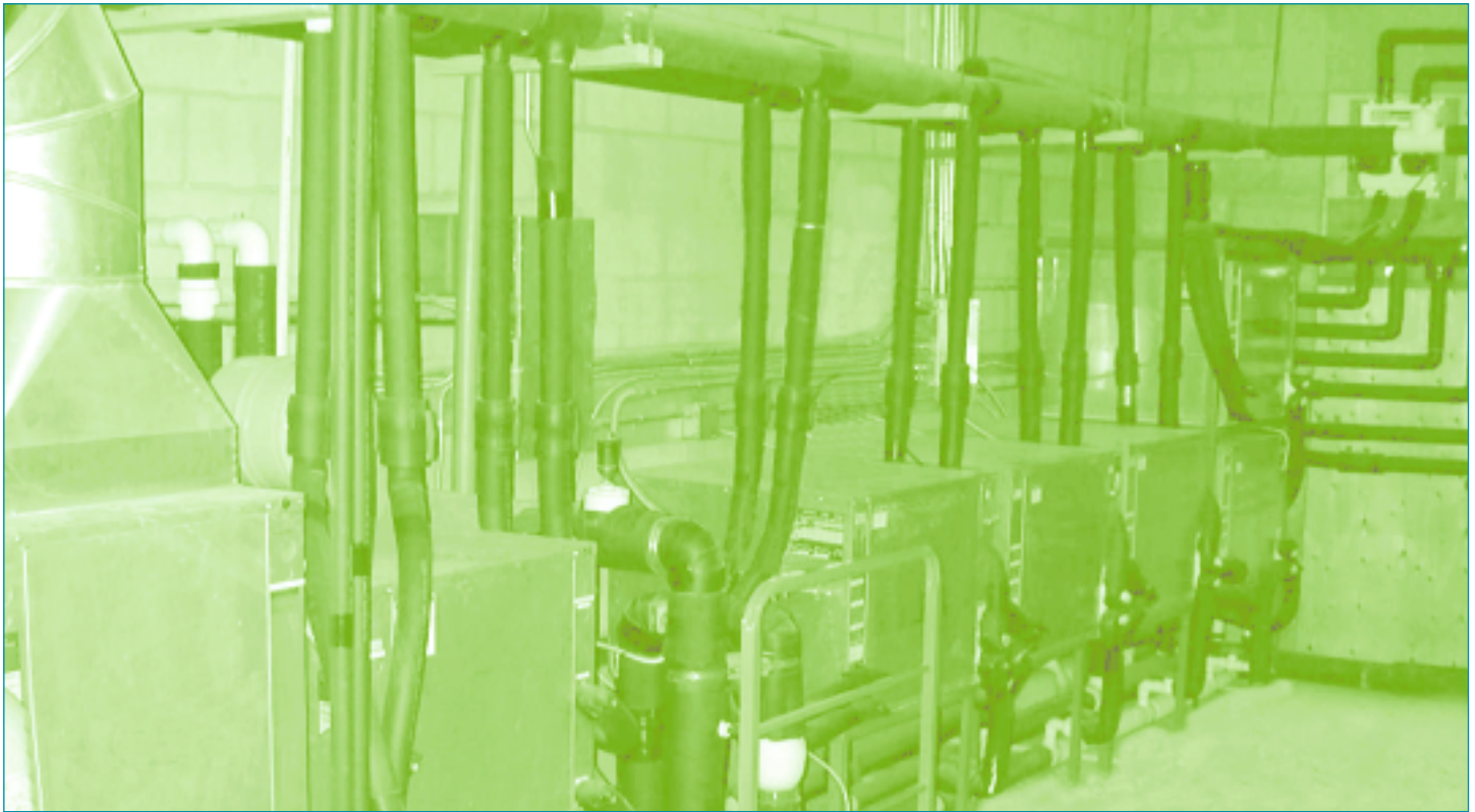
Mechanical room with water-water heat pumps to make ice, water-water unit to heat ice area and forced air unit used to heat lobby.