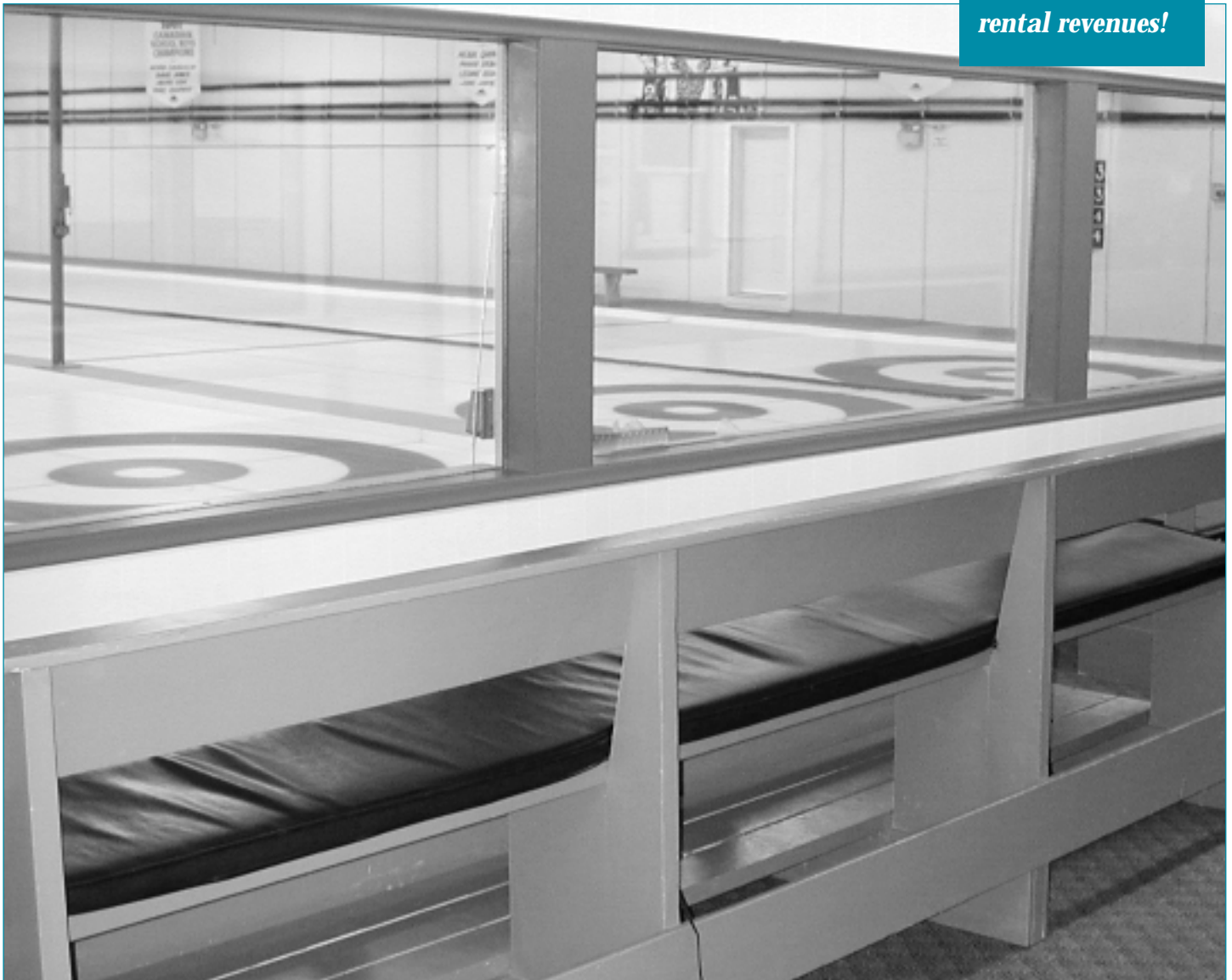
Viewing area of the lobby.

Most importantly club members are satisfied... more comfort plus increased rental revenues!