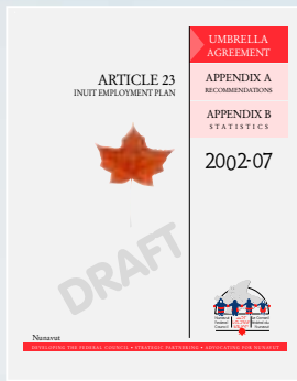
Article 23 Inuit Employment Plan 'Umbrella'