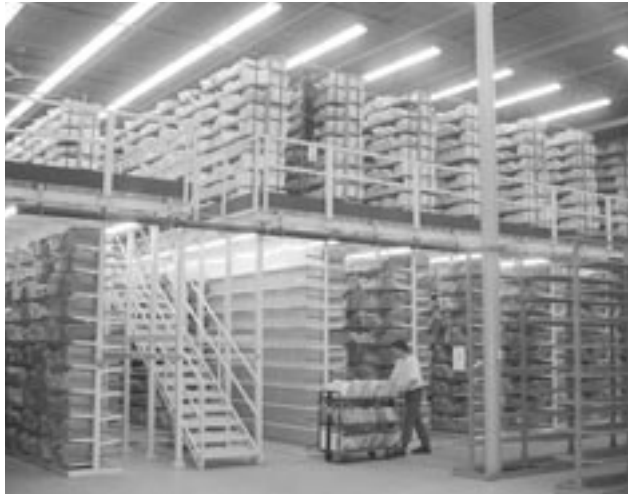
Federal Records Centre, Manitoba Region, in Winnipeg. A storage room with double tier shelving that now houses the personnel files of former public servants.

required for reference or research, segregate for permanent preservation those records designated as archival or historical by the National Archivist, and destroy other records in a timely and secure manner when they are no longer required. The Federal Records Centres also hold back-up copies of electronic records and other records essential to the operations of government and the protection of rights in the event of disaster or emergency.