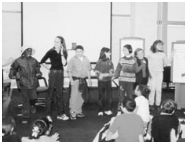
Students participating in a genealogy workshop.

Young Canadians are an important audience that the National Archives has neglected in the past. The Archives is fully aware how crucial it is to get young people interested in the sources of their past by proving to them that it can be fun—and of course educational—to look through “old” documents. Accordingly, the Archives has added a “youth” component to its public programming, a component that will be expanded in the coming years. This initiative also fits in well with the Government of Canada’s focus on children and youth.