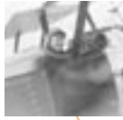
Major Raymond Collishaw in his Sopwith Camel, France, 1918