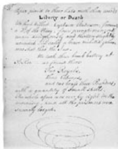
A page from the Journal of the Siege of Quebec, December 31, 1775, R5404-0-6-E, vol. 1.