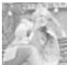
Irving Layton, by Roloff Beny, Rome, 1981