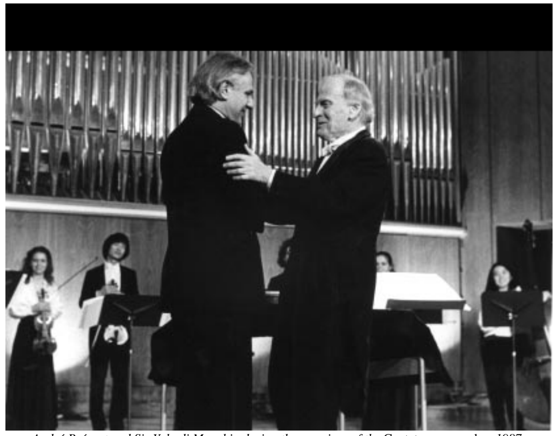
André Prévost and Sir Yehudi Menuhin during the premiere of the Cantate pour cordes, 1987.

MUS 264/H1,5 Célébration . – 1966. – 1 audio tape (8 min. 5 sec.): polyester; 19 cm/sec.; reel: 13 cm.