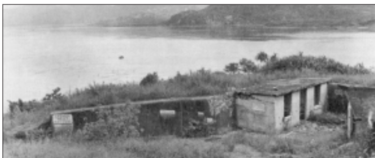
LYE MUN PASSAGE BATTERY.

Hong Kong also lacked adequate naval defence. All major naval vessels had been withdrawn, and only one destroyer, HMS Thracian , several gunboats and a flotilla of motor torpedo boats remained.