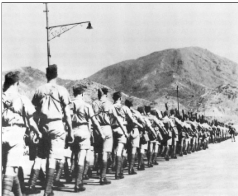
CANADIAN CONTINGENT IN HONG KONG, 1941.