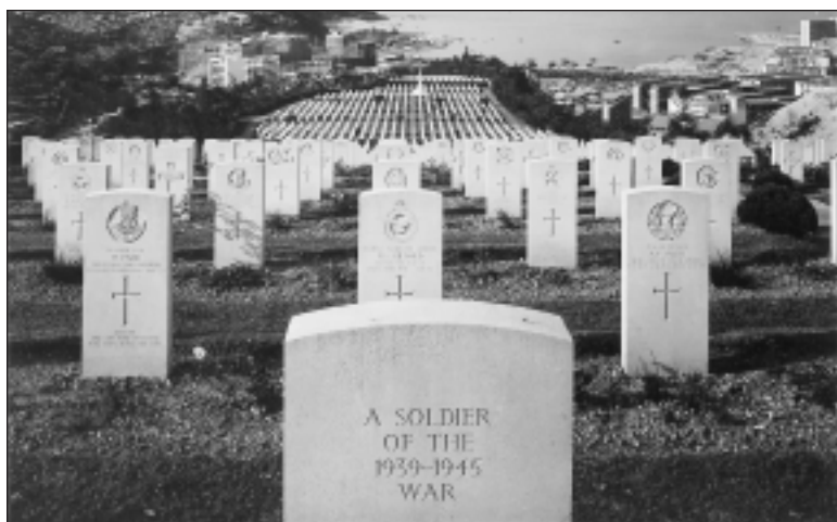
SAI WAN BAY WAR CEMETERY.

The Yokohama British Commonwealth War Cemetery, located at Hodogaya near Yokohama, is the only British Commonwealth Cemetery in Japan. Here 137 Canadian dead, most of whom died as prisoners-of-war in Japanese internment camps, lie with their New Zealand comrades beneath a Cross of Sacrifice in one of the four sections of the cemetery.