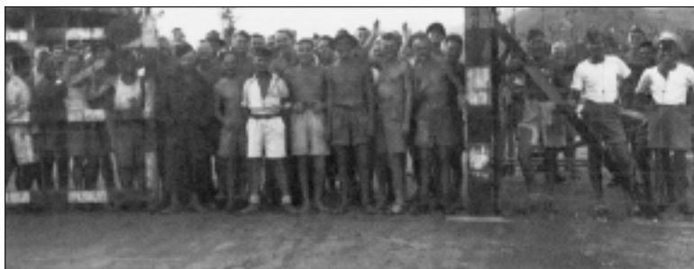
GROUP OF CANADIAN AND BRITISH PRISONERS AWAITING LIBERATION BY LANDING PARTY FROM HMCS PRINCE ROBERT .

The strength of the invasion force was overwhelming, and by early December 19, the Japanese had reached as far as the Wong Nei Chong and Tai Tam Gaps, again proving their effectiveness at night fighting.