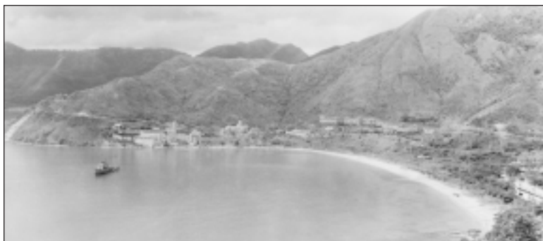
THE REPULSE BAY HOTEL, WHERE THE ROYAL RIFLES FOUGHT FROM DECEMBER 20 TO 22, 1941.

military deterrent against the Japanese, and reassure Chinese leader Chiang Kai Shek that Britain was genuinely interested in defending the colony. Canada was asked to provide one or two battalions for that purpose.