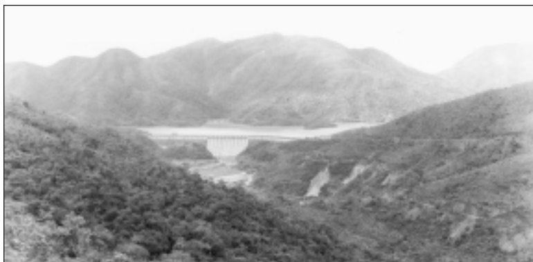
TY TAM TUK RESERVOIR.

The arrival of the Canadians changed the plans for the defence of the colony. The original strategy had called for the main defence to be on the island with only one infantry battalion deployed on the mainland for demolition duties and for delaying purposes. The two additional battalions enabled General Maltby to assign three battalions to the mainland. These battalions would fight from the “Gin Drinkers’ Line”, 18 kilometres of defences stretching across rugged hill country and studded with trenches and pillboxes (concrete bunkers). It was hoped that these additional battalions would protect Kowloon, Victoria harbour, Lye Mun Passage, and the northern areas of Hong Kong Island from artillery fire launched from the mainland. If the enemy launched a major offensive, the mainland battalions would be ordered to complete demolitions, clear vital supplies and sink any remaining ships in the harbour so they would not fall into enemy hands. The remaining forces on Hong Kong Island were to prepare against any Japanese attack from the sea.