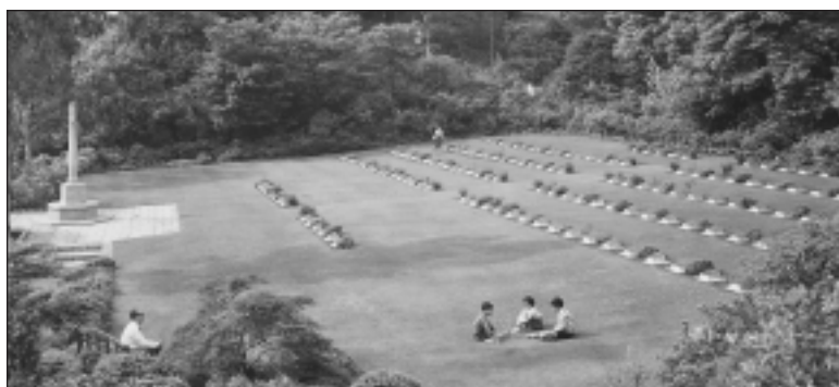
YOKOHAMA BRITISH COMMONWEALTH WAR CEMETERY.