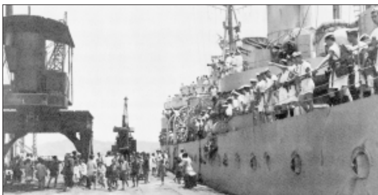
HMCS PRINCE ROBERT, NEXT TO THE PIER DURING THE HONG KONG LIBERATION IN AUGUST 1945.

Further Japanese attacks followed and the "Gin Drinkers' Line" could no longer be held. Midday on December 11, General Maltby ordered the mainland troops to withdraw from the mainland. The Winnipeg Grenadiers covered the Royal Scots' withdrawal down the Kowloon Peninsula. The Punjabs moved at night and the Rajputs, who had been left to guard Devil's Peak, followed. The evacuation