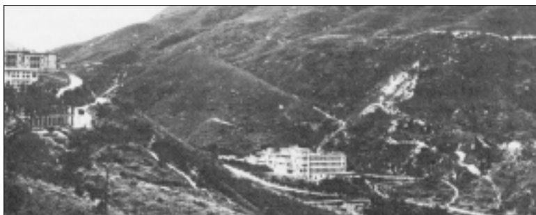
THE SALESIAN MISSION, VIEWED FROM THE LYE MUN BARRACKS; AND IN THE BACKGROUND, MOUNT PARKER.

The Mainland Brigade, commanded by Brigadier C. Wallis, was composed of the Royal Scots and the two Indian battalions. The Canadian signal section was allotted to this brigade. The Island Brigade, under Brigadier Lawson, consisted of the two Canadian battalions and the Middlesex Regiment. The Canadian units, facing the sea, were assigned the task of defending the island's beaches as their primary role, while the Middlesex unit had the task of holding the system of pillboxes around the island.