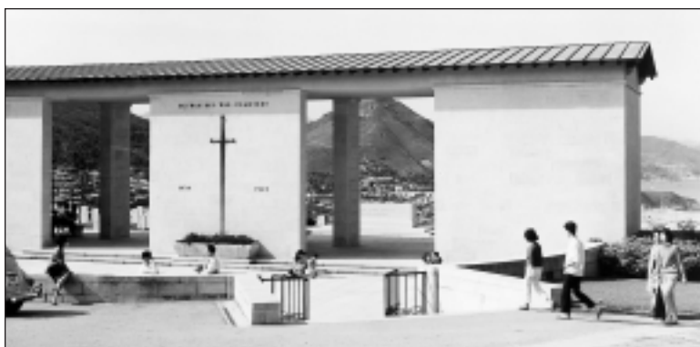
SAI WAN BAY MEMORIAL.

First, they attempted a thrust along the shore of Repulse Bay in the hope of reaching Wong Nei Chong Gap - and the West Brigade. They managed to drive the enemy out of an area around the Repulse Bay Hotel. However, they were unable to dislodge the Japanese from the surrounding hill positions and were forced to withdraw. One company of the Royal Rifles was left to hold this area and a renewed effort to break through was made on December 21. Next came an attempt to reach Won Nei Chong by a more easterly route. Despite heavy enemy opposition south of Tai Tam Tuk Reservoir, the Royal Rifles succeeded in driving the Japanese out of a number of hill positions and in destroying a group holding the crossroads south of the reservoir.