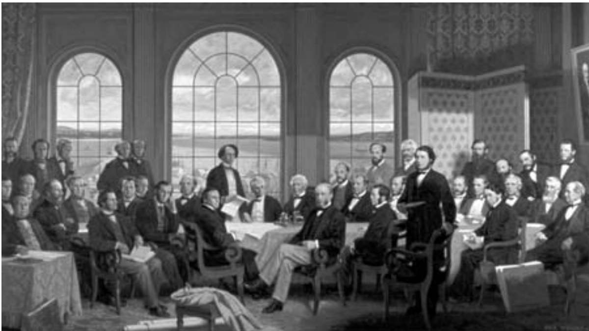
The Fathers of Confederation, Quebec Conference, 1864.