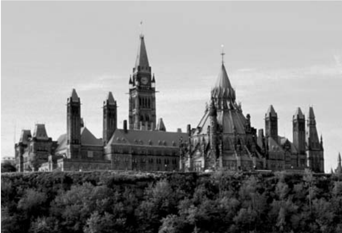
The Senate and the House of Commons meet in the Parliament Buildings.