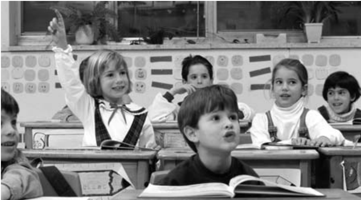
The provincial legislatures have the constitutional right of direct taxation for areas under provincial jurisdiction, such as education.

licences for provincial and municipal revenue purposes, local works and undertakings (with certain exceptions), incorporation of provincial companies, solemnization of marriage, property and civil rights in the province, the creation of courts and the administration of justice, fines and penalties for breaking provincial laws, matters of a merely local or private nature in the province, and education (subject to certain rights