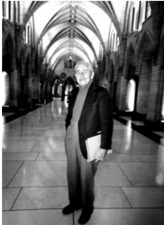
The Honourable Eugene A. Forsey, 1904-1991

Regina Manifesto, the CCF's founding declaration of policy.