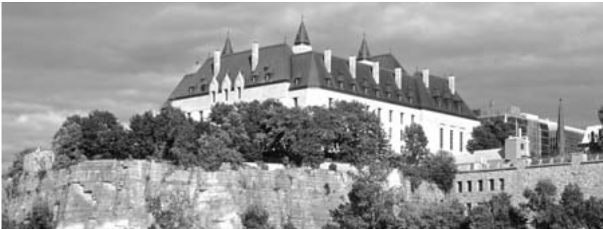
The Supreme Court of Canada Building.