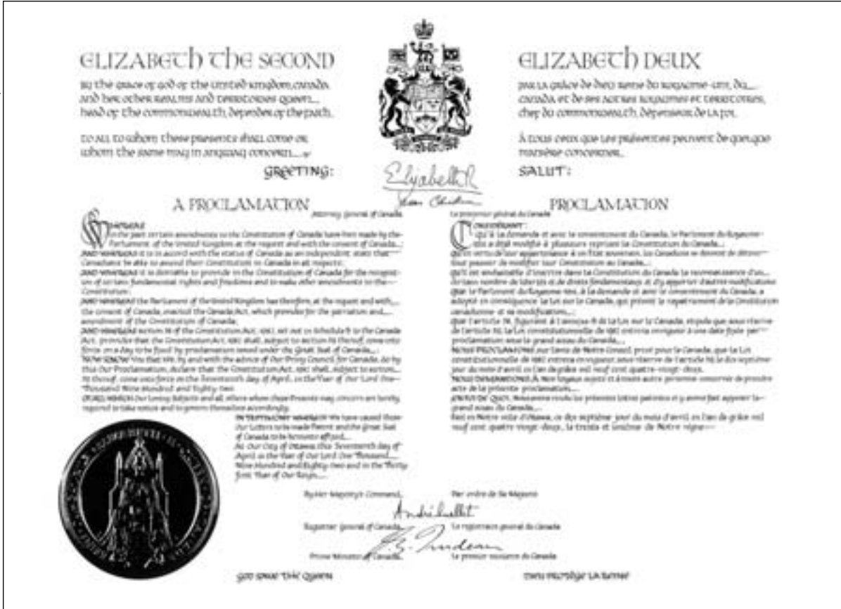
The Constitution Act, 1982, came into force on April 17, 1982.

insisted on the Fathers finding another title. They did, from Psalm 72: "He shall have dominion also from sea to sea, and from the river unto the ends of the earth." It seemed to fit the new nation like the paper on the wall. They explained to Queen Victoria that it was "intended to give dignity" to the Union, and "as a tribute to the monarchical principle, which they earnestly desire to uphold."