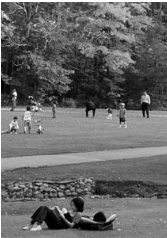
Municipal governments take care of city parks.

There are now roughly 4,000 municipal governments in the country. They provide us with such services as water supply, sewage and garbage disposal, roads, sidewalks, street lighting, building codes, parks, playgrounds, libraries and so forth. Schools are generally looked after by school boards or commissions elected under provincial education Acts.