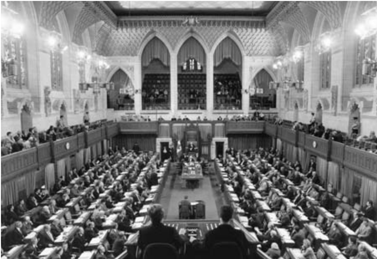
The House of Commons in session.