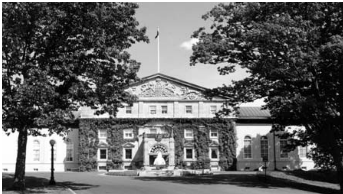
Rideau Hall is the residence of the Governor General.