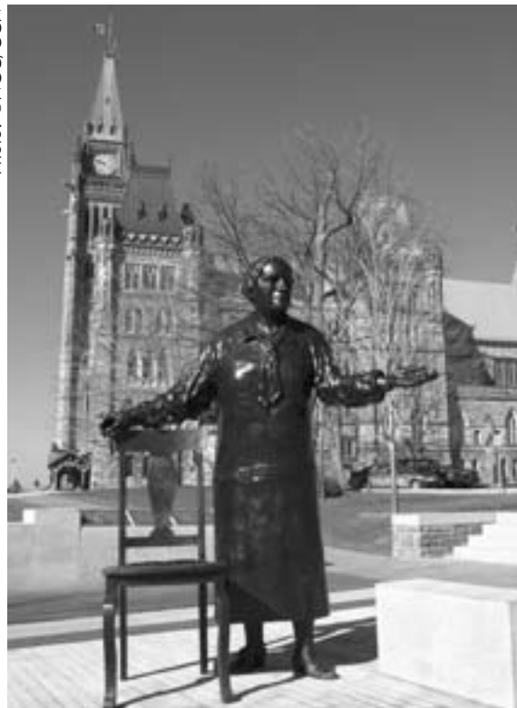
In this bronze sculpture on Parliament Hill, Emily Murphy, one of the "Famous Five" who fought for women's legal status as persons, invites us to celebrate women's equality, now enshrined in the Charter.