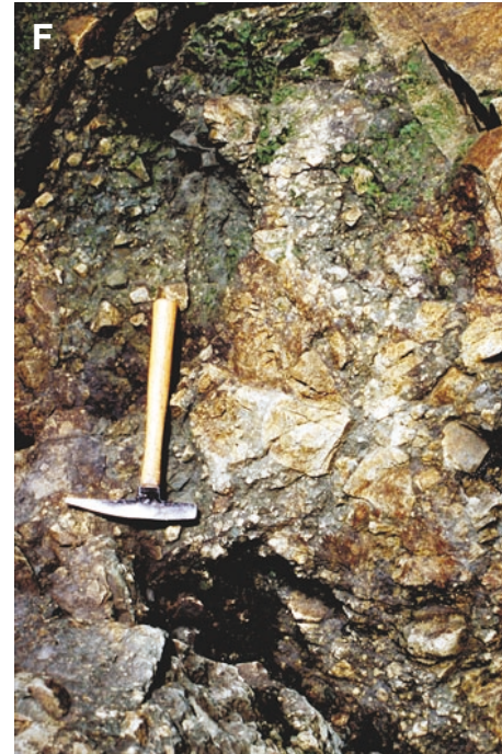
Figure 3. D) Close-up of fault gouge of the St. Lawrence Fault at Sault-au-Cochon. Note the faintly developed fault fabric. E) Fault breccia of the Cap-Tourmente Fault. F) Fault breccia with a composite matrix of crush breccia and pseudotachylyte (dark-coloured material) at Cap-Tourmente.