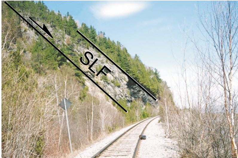
Figure 2. Panoramic view of the St. Lawrence Fault (SLF) at Sault-au-Cochon. Fault breccia and cataclasite are exposed along the shoreline at the base of the cliff. View toward the northeast.