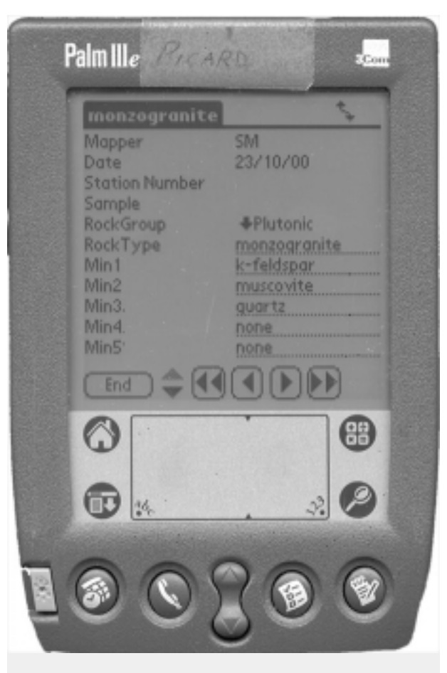
Figure 4. a) Rocks/Minerals thematic page of geological data-collection form (complete form available by scrolling up/down).