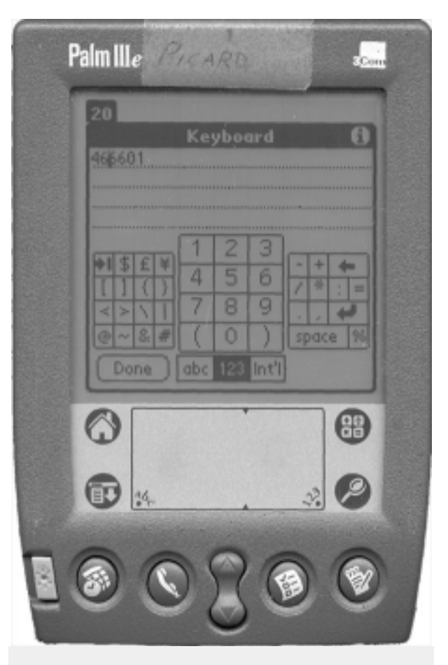
Figure 3. The on-screen touch-sensitive keypad used for numerical data entry.