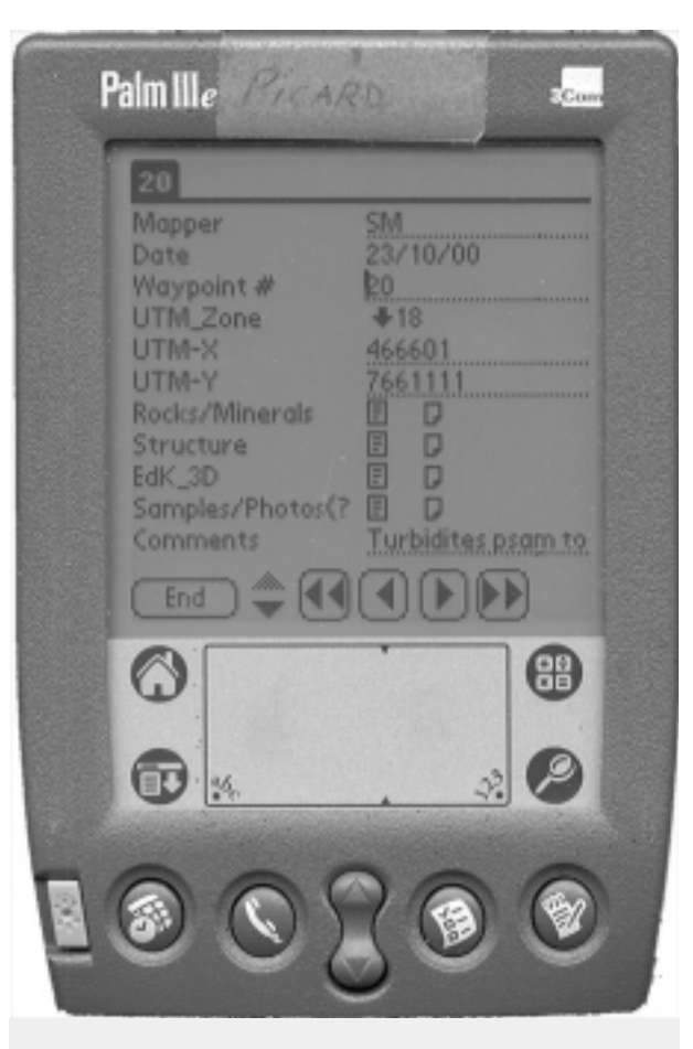
Figure 2. Main page of geological data-collection form.