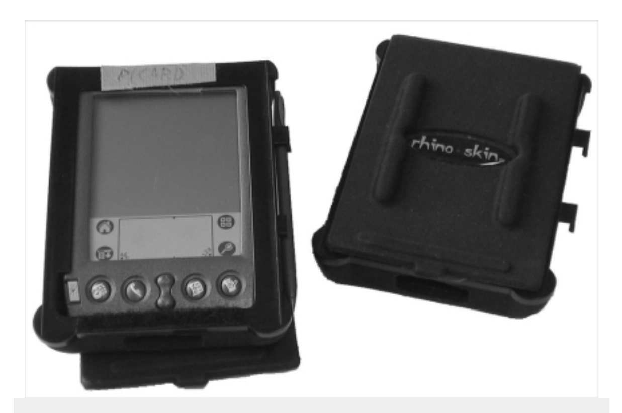
Figure 1. b) Palm IIIe in Rhinoskin's Palmsuit semi-rigid neoprene protective case.