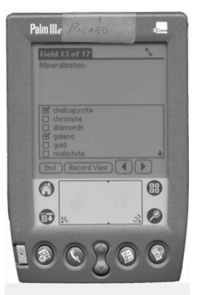
Figure 4. c) Mineralization multi-pick list.