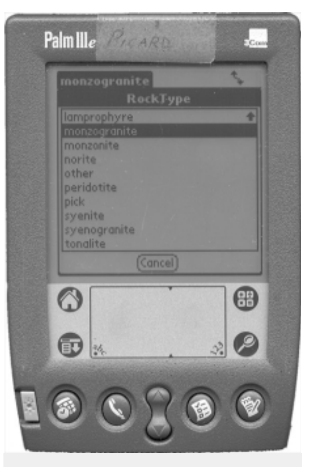
Figure 4. b) RockType picklist showing some of the available choices (complete list available by scrolling up/down).