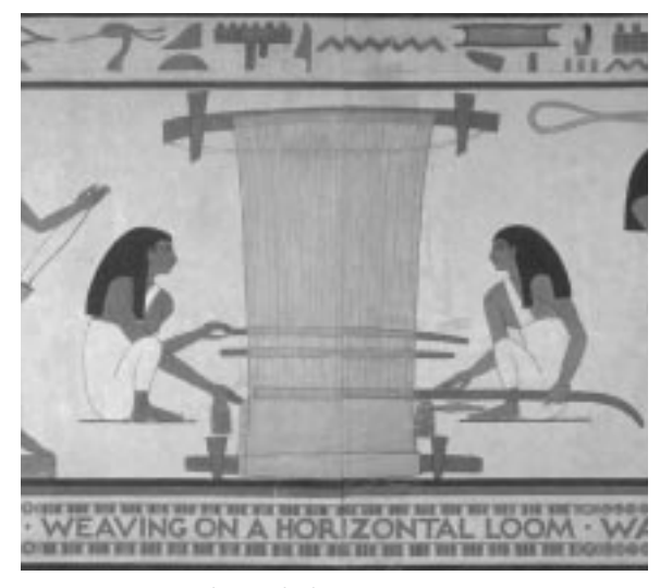
Women weaving linen cloth Drawing: Winnifred Needler Photo: Harry Foster (CMC S97 10782)

In the Old Kingdom, goddesses and elite women were portrayed wearing a sheath with broad shoulder straps. In the New Kingdom, the dress had only one thin strap. These dresses were