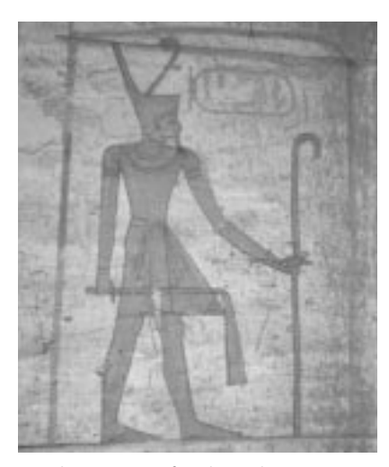
Tomb painting of a pharaoh wearing a short kilt CMC ECD98-007 #72