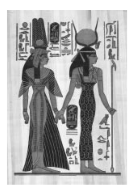
Queen Nefertari (left) wears a white linen robe in the New Kingdom style. Isis wears a tight-fitting linen dress typical of the style popular during the Old and Middle kingdoms.

The men wore knee-length shirts, loincloths or kilts made of linen. Leather loincloths were not uncommon, however. Their garments were sometimes decorated with gold thread and colourful