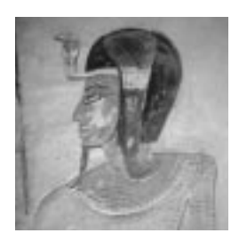
A prince wearing the sidelock of youth and a uraeus on his forehead CMC S97 9822

beadwork. The priests, viziers and certain officials wore long white robes that had a strap over one shoulder, and sem -priests (one of the ranks in the priesthood) wore leopard skins over their robes.