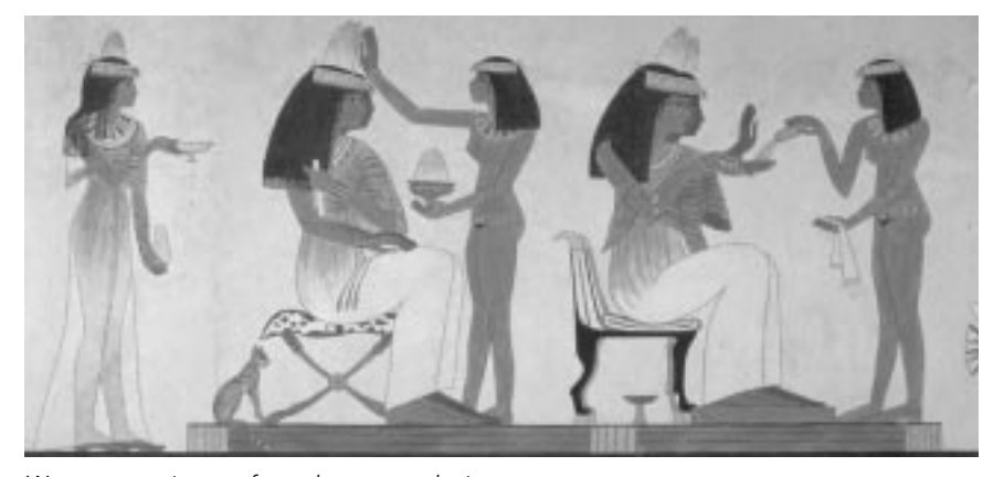
Women wearing perfumed cones and wigs Drawing: Winnifred Needler Photo: Harry Foster (CMC S97 10785)

Priests shaved their heads and bodies to affirm their devotion to the deities and to reinforce their cleanliness, a sign of purification.