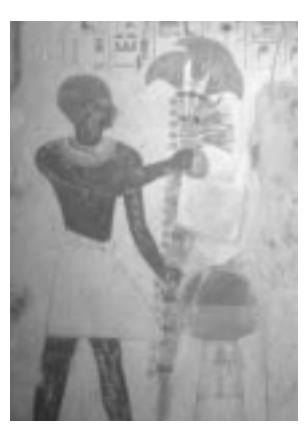
A priest with shaven head CMC S97 9833