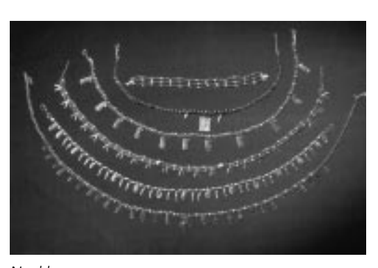
Necklaces CMC ECD98-040 #36

A collar fit for a king. This collar, in the shape of Nekhbet, the vulture goddess, was found in Tutankhamun's tomb. The vulture holds two shen rings (symbols of eternity) in its claws. CMC ECD98-028 #9 (photo)