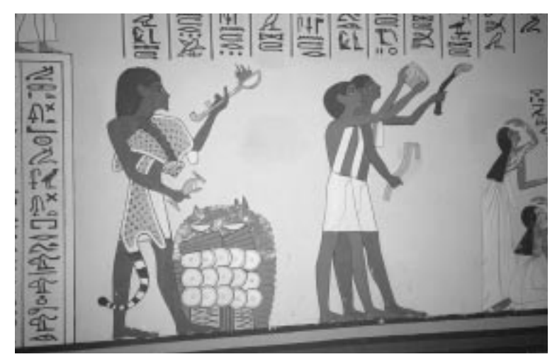
A sem-priest (left) wears a short kilt and a leopard skin, and the men wear short kilts. CMC ECD98-014 #9