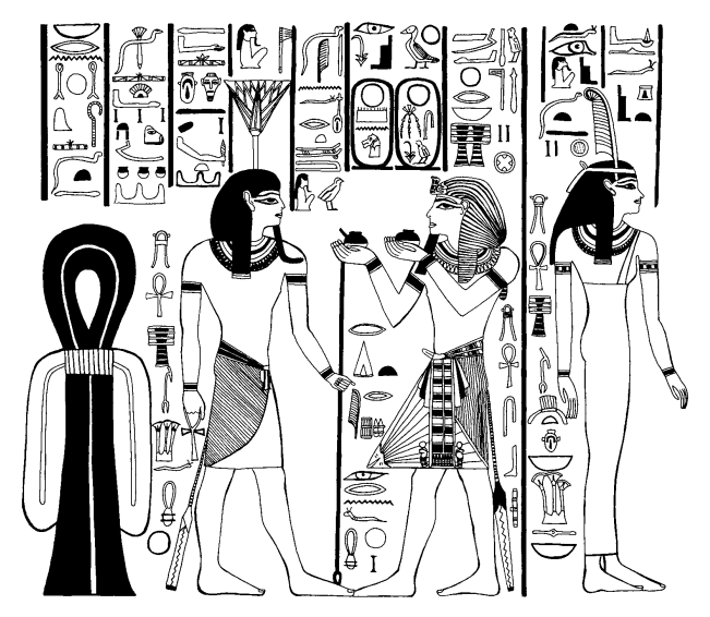
This drawing illustrates how artists idealized the human figure. Ramses I (centre) makes an offering to the god Nefertem (left). The goddess Maat stands behind Ramses.