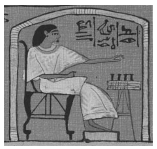
A nobleman plays a board game called senet. He wears a long white linen robe in the New Kingdom style.