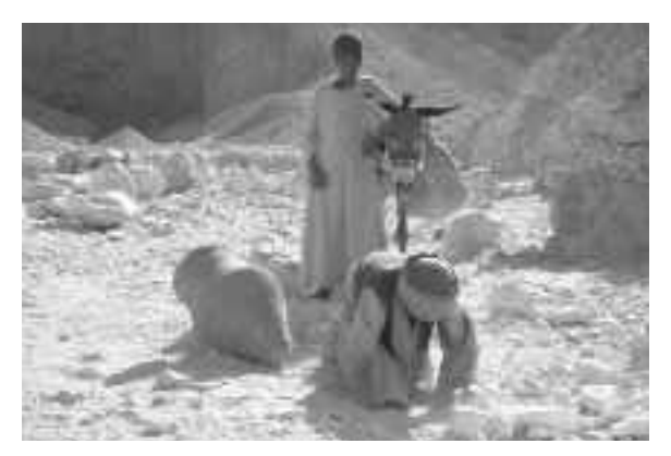
Howard Carter's water boy found the first step that led to Tutankhamun's tomb. Re-enactment scene from the film Mysteries of Egypt.