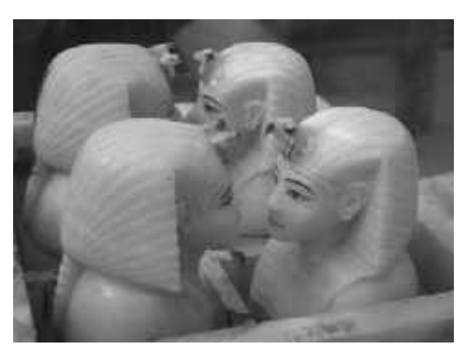
Tutankhamun's internal organs were placed in these canopic jars made of calcite (a translucent stone). CMC ECD98-037 #90 (photo)

This famous quote sums up the excitement of this incredible discovery that took the world by storm. The awe-inspiring beauty of Tutankhamun's treasures has generated enormous interest in ancient Egypt.