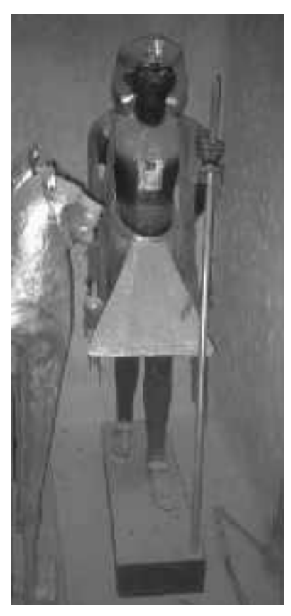
Inside the antechamber. One of two guardian figures that protected the entrance to Tutankhamun's burial chamber. Re-enactment scene from the film Mysteries of Egypt. CMC ECD98-026 #43