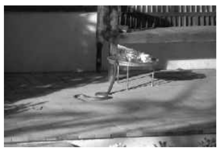
The cobra slithers over the floor and up a bench on its way to the canary's cage. Re-enactment scene from the film Mysteries of Egypt. CMC ECD98-026 #10

During the recent excavations which led to the discovery of the tomb of Tutankhamen, Mr. Howard Carter [the discoverer] had in his house a canary which daily regaled him with its happy song. On the day, however, on which the entrance to the tomb was laid bare, a cobra entered the house, pounced on the bird, and swallowed it. Now, cobras are rare in Egypt, and are seldom seen in winter; but in ancient times they were regarded as the symbol of royalty, and each Pharaoh wore the symbol upon his forehead, as though to signify his power to strike and sting his enemies.<sup>19</sup>