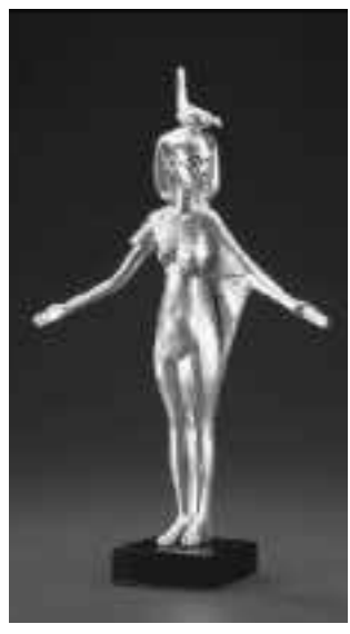
Selkis, one of the four goddesses who protected the gold shrine that held Tutankhamun's canopic jars

the tomb there is a flight of stairs leading to a short corridor. The first room is the antechamber, where many household items were found. Off this room is an annex, and at the far end is an opening that leads to the burial chamber. This chamber was guarded by two black sentry-statues that represent the royal ka (soul).