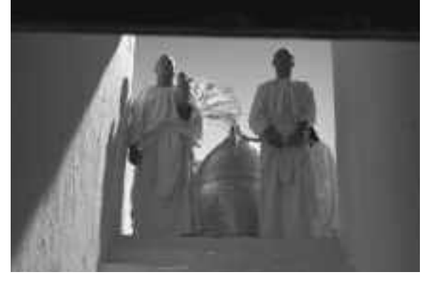
Priests lead the funeral procession taking Tutankhamun's coffin to his tomb. Re-enactment scene from the film Mysteries of Egypt. CMC ECD98-010 #52

the ritual "opening of the mouth" performed by his suc-