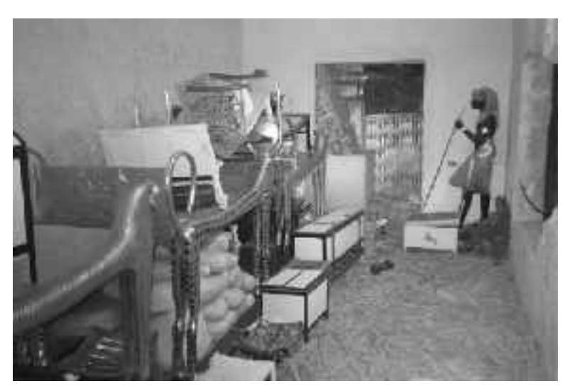
Royal beds, chests and round boxes of food were found in the antechamber of Tutankhamun's tomb. Robbers had left the tomb in a state of disorder. To prevent further intervention, priests resealed the tomb immediately after the robbers were discovered, without cleaning up the mess. Re-enactment scene from the film Mysteries of Egypt. CMC ECD98-027 #61

The burial chamber contains Tutankhamun's sarcophagus and coffin. Its walls are painted with scenes of Tutankhamun in the afterworld: the ritual of "opening the mouth" to give life to the deceased, the solar bark on which he travelled to the afterworld, and Tutankhamun's ka in the presence of Osiris. Off the burial chamber is the Treasury room, where a magnificent gilded canopic shrine was found. This was the most impressive object in the Treasury. A gold chest held four canopic jars containing the dead pharaoh's internal organs (lungs, stomach,