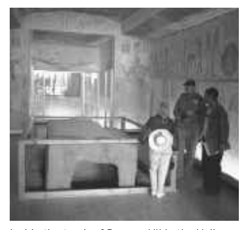
Inside the tomb of Ramses VII in the Valley of the Kings CMC ECD98-007 #47