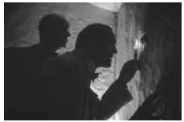
Howard Carter and Lord Carnarvon peer into Tutankhamun's tomb. Re-enactment scene from the film Mysteries of Egypt.