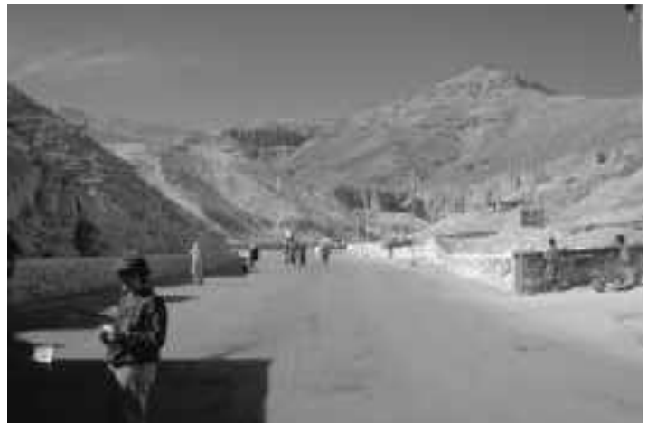
Road leading to the tombs in the Valley of the Kings. The Theban Peak can be seen in the background. CMC ECD98-018 #5

The tombs were cut into the limestone rock in a remote wadi (a dry river valley) on the west side of the Nile, opposite the present-day city of Luxor. Their walls were painted