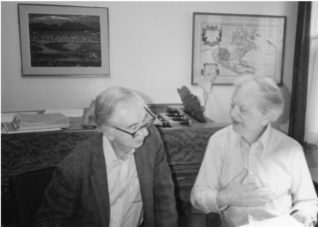
István Anhalt and George Rochberg, 1985.