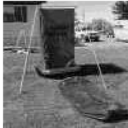
Figure 3-13. SC spill containment single decon unit with bladder