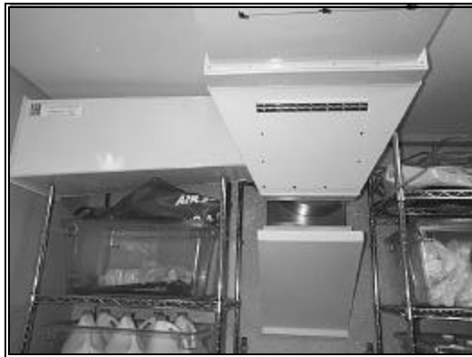
Figure 5. Section 4, storage area

Finally, section 4 comprises a storage and redressing area and is used to store victim clothing, storage shelving, decontamination supplies and solutions, supplied air, and extra tentage (fig. 5). Section 4 also includes a ventilation system that draws air from all four sections through a HEPA filter and vents to the outside (fig. 6).