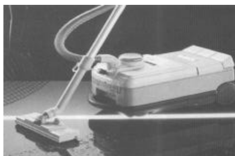
Figure 3-6. Karcher AEDA1 decontamination equipment