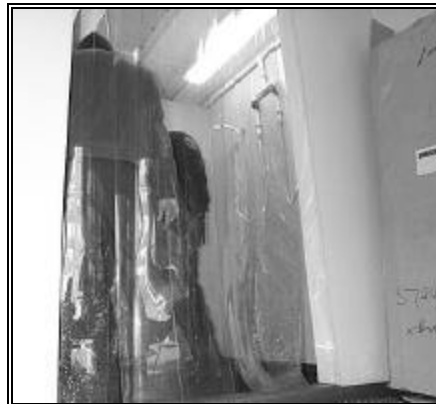
Figure 2. Section 1, entrance

The unit is divided into four sections. Smoked-out plastic curtains divide each section including the entrance and exit to provide privacy. The first section is the entrance, shown in figure 2. The entrance is utilized as a storage area for the water heater, when the unit is not in use as a clothing removal area.