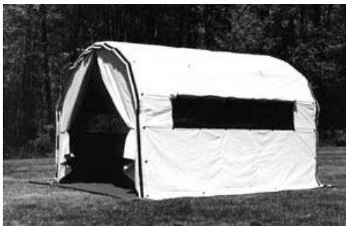
Figure 3–10. TVI first response shelter

This guide primarily focuses on decontamination equipment used for removing and/or neutralizing CB contamination from personnel (to include clothing), equipment, and infrastructure. However, emergency first responders should be aware that there is equipment used to support CB decontamination operations. Decontamination shelters and decontamination units (shower/dressing rooms with basins and bladders) are examples of equipment used to support decontamination operations. Decontamination shelters are used to provide protection to personnel (victims, technicians, etc.), subsequent to decontamination operations, from any remaining CB contamination. Examples of decontamination shelters are the TVI first response shelter (fig. 3–10) and the TVI Quick-E WMD command post (fig. 3–11).