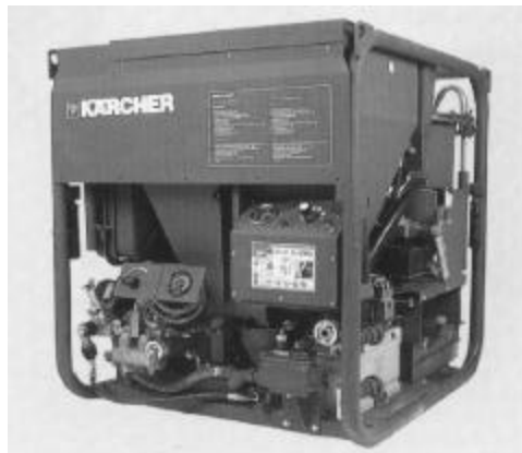
Figure 3–9. Karcher C8–DADS direct application decontamination system

decontamination system (shown in fig. 3–9). This system uses both physical (removes contaminate) and chemical (neutralizes contaminant) decontamination processes.