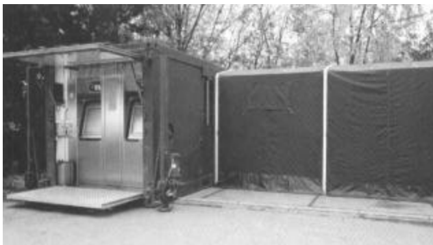
Figure 3-5. Karcher mobile field laundry CFL 60

Thermal processes remove CB contaminants through vaporization. It should be noted that another means of decontamination is necessary for agent detoxification. Examples of decontamination equipment utilizing a thermal process are the Karcher mobile field laundry CFL 60 (fig. 3-5) that both physically and thermally removes decontaminates, and the Karcher AEDA1 decontamination equipment (fig. 3-6) that employs a combination of low-temperature thermal technology and mechanical technology.