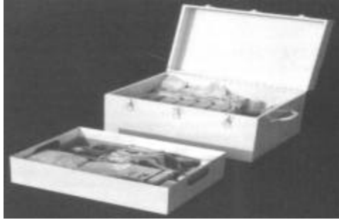
Figure 3–7. NBC-DEWDECON-PERS Emergency Response Personnel Decontamination Kit

For general decontamination information the reader can refer to Responding to A Biological or Chemical Threat: A Practical Guide (see app. B). For information on methods and techniques utilized during mass casualty decontamination, the reader should refer to Guidelines for Mass Casualty Decontamination During a Terrorist Chemical Agent Incident (see app. B).