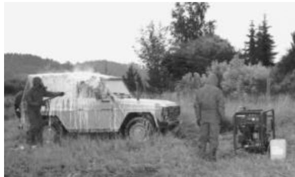
Figure 3–8. Karcher MPDS multipurpose decontamination system

Equipment decontamination refers to the ability to decontaminate CB agent or TIMs from the exterior surfaces of equipment. This includes the decontamination of both large (e.g., vehicles) and small items (e.g., computers, communications equipment). An example of this type of equipment is the Karcher MPDS multipurpose decontamination system (shown in fig. 3–8). The MPDS is equipped with a high-pressure spray system and depending on the decontaminant that was used, either chemical or mechanical technologies are employed.