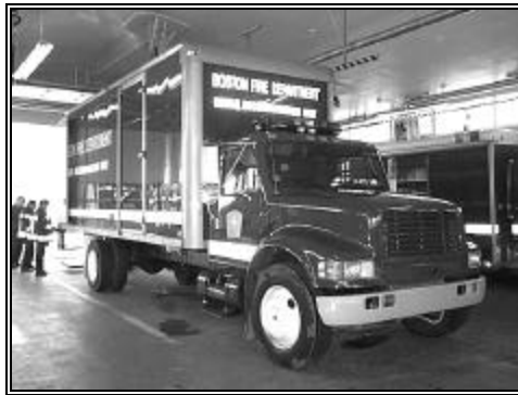
Figure 1. Mobile decontamination unit

The Boston Fire Department recently completed the construction of a new Mobile decontamination unit, shown in figure 1. This unit is a 22 ft International box truck that has been outfitted to function as a decontamination unit, responding to hazardous materials incidents. The unit provides 6 indoor showers and 4 outdoor showers using warm water and a sheltered area for changing to address modesty issues. It has been outfitted with polyethylene walls, floor and ceiling, plumbing, electrical, ventilation equipment, supplied air, and a hot water system. In preliminary testing by the Boston Fire Department it was found that it would take a civilian 6 min to 7 min to move through the decontamination sections and 5 min to 7 min for a firefighter dressed in level A. The decontamination unit also carries military field shower units and emergency decontamination shelters. The showers in the units are capable of supplying warm water for decontamination. The water heater used for the field shower is capable of delivering 33000 British thermal unit (Btu).