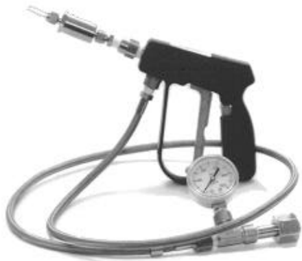
Figure 3-2. KI-05 standard unit