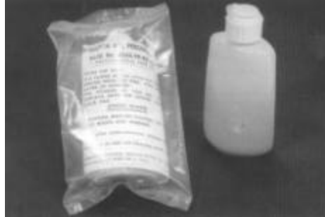
Figure 3-1. Decontamination Kit, Personal No. 2, Mark 1