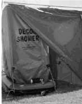
Figure 3-12. SC spill containment single shower stall with dressing room

SC spill containment single shower stall with dressing room (fig. 3-12) and the SC spill containment single decon unit with bladder (fig. 3-13). Appendix C contains a listing of commercially available decontamination shelters.