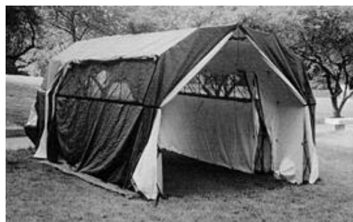
Figure 3–11. TVI Quick-E WMD command post

Portable decontamination shower units keep water contained by patented recovery bladders connected to a catch basin while the victims stand on a stool above the contaminated water. The units are available as single, double, or quad units. Examples of decontamination units are the