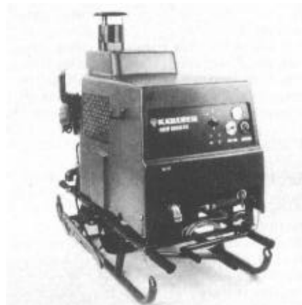
Figure 3-3. Karcher HDS 1200 EK high-pressure steam jet cleaner unit