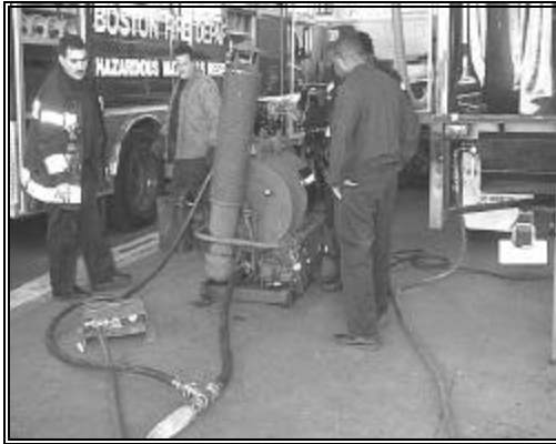
Figure 7. Generator

The entire system must be pressurized to no more than 40 lb psi. As a result, a fire engine is utilized as a manifold to regulate the pressure from any water source (i.e., hydrant). Liquid runoff and waste runs via gravity feed through drains that are located in the floor of every section into a collapsible holding tank (fig. 8). A hazardous materials contractor then removes the contaminated water from the container.