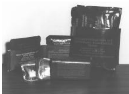
Figure 3-4. Decontamination Kit, Individual Equipment: M295

A reactive sorbent first adsorbs the CB contaminate and then chemically detoxifies it. Reactive sorbents have been prepared by soaking simple sorbents in alkaline solutions, effectively “loading” the matrix with caustic material. Once sorbed into the sorbent matrix, the agent encounters the alkaline medium, reacts with it, and is destroyed. A second approach for reactive sorbents is to prepare a polymeric material with reactive groups attached to the polymeric backbone. In this case, the agent is sorbed by the polymeric matrix, encounters the reactive group, and is neutralized by it. A third approach is to use microcrystalline metal oxides such as aluminum oxide or magnesium oxide. An example of decontamination equipment utilizing reactive sorbents is the Decontamination Kit, Individual Equipment: M295, manufactured by Truetech (fig. 3-4).