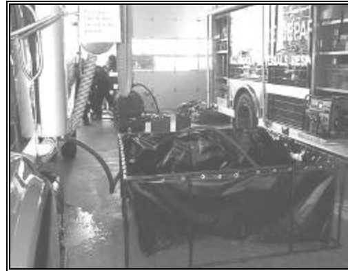
Figure 8. Holding tank

The department is currently in the process of working on revisions to their design to ensure optimal trailer levels in the future. The Boston Fire Department built the decon unit using the knowledge they have acquired during working hazardous materials incidents. However, there are many commercial decontamination trailer vendors available. Below are the names and contact information for some of them.