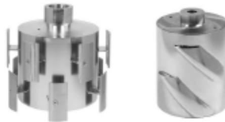
Two new AFT rotor designs: The EP™ rotor (left) and the Gladiator HC™ rotor (right)

Advanced Fiber Technologies (AFT) of Montreal, Quebec, is the world’s leading producer of customized screening solutions for the pulp and paper industry, and has been in operation for more than 100 years. In collaboration with researchers at UBC, AFT developed a new high-capacity, low-energy pulp screen rotor technology called the Gladiator HC™ rotor. To demonstrate the performance of the new technology in the field, Canfor, AFT, UBC, BC Hydro and Natural Resources Canada partnered to test and demonstrate the new screen operation at the Canfor mill. Started in the fall of 2005, this very successful project was completed in early 2006.