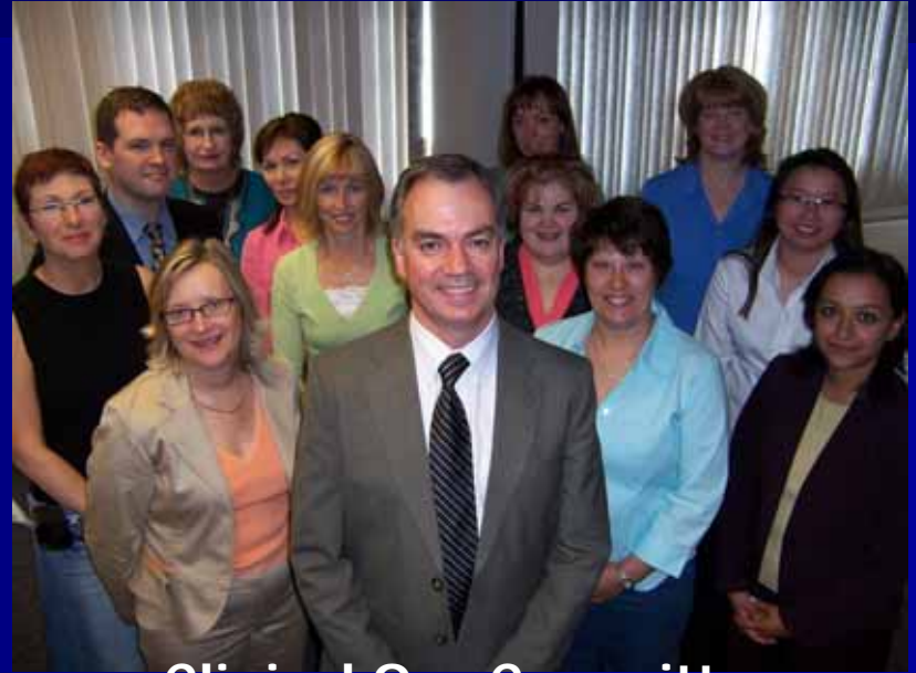
Clinical Ops Committee: Multi-centred clinician group.