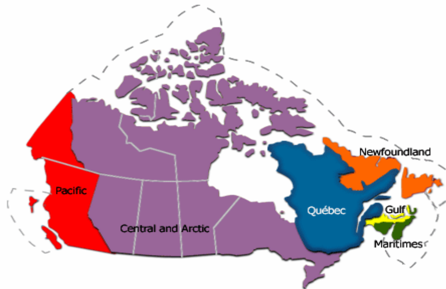
Figure 1: Map of the Department of Fisheries and Oceans' (DFO) six administrative regions.