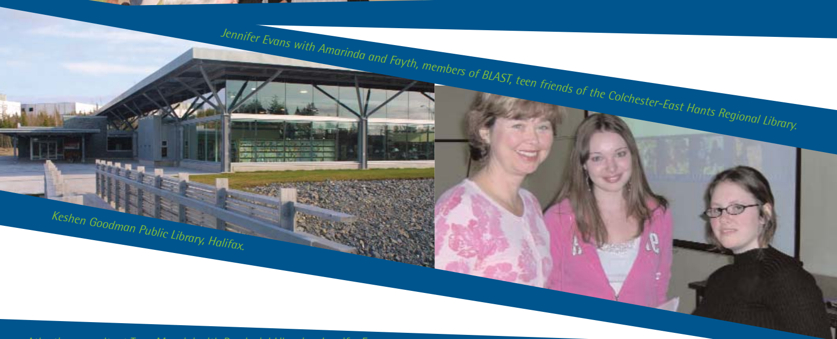
Keshen Goodman Public Library, Halifax.