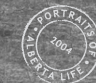
Photo: Provincial Archives of Alberta, Portraits of Alberta Life; available from Alberta Queen's Printer

New OHS Code and Explanation Guide - They're Hot!