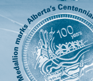
All photos featured on the cover of the Alberta Bookmark can be purchased from Alberta Queen's Printer.

Calgary, 1912. Alberta's cities saw tremendous growth in the first decade of the 20th century, as evidenced by this view of Eighth Avenue and First Street. Many of the buildings lining these streets owe their look of permanence and elegance to the extensive use of sandstone in construction. This locally quarried stone was used for rebuilding after a fire in 1886 destroyed much of the business district.