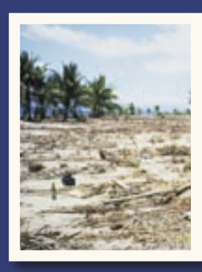
The first wave of a tsunami may not be the largest. Other waves may follow every few minutes, for a period of hours.

It is important to remember that tsunamis are rare events and not all earthquakes will generate a tsunami. However, it is also critical to know what to do as a precaution if you live in a vulnerable area.