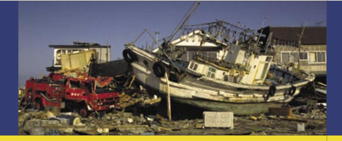
The potential power of a tsunami is illustrated here. A fishing boat has been tossed on shore and a fire truck has been destroyed by debris.