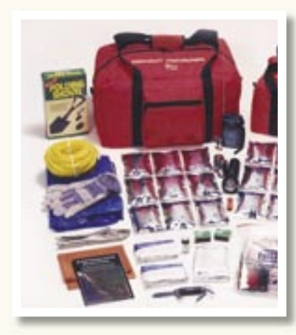
Be prepared to survive on your own for at least three days – this means when you leave, take your emergency supplies kit from your home, work or car with you.

Once a community is alerted that the arrival of a distant tsunami is (or may be) expected; residents will be warned in a number of different ways. In some locations, a siren is used, while others depend on a telephone fan-out or a door-to-door or loud hailer system. Once you have the initial warning, listen to your radio for updates.