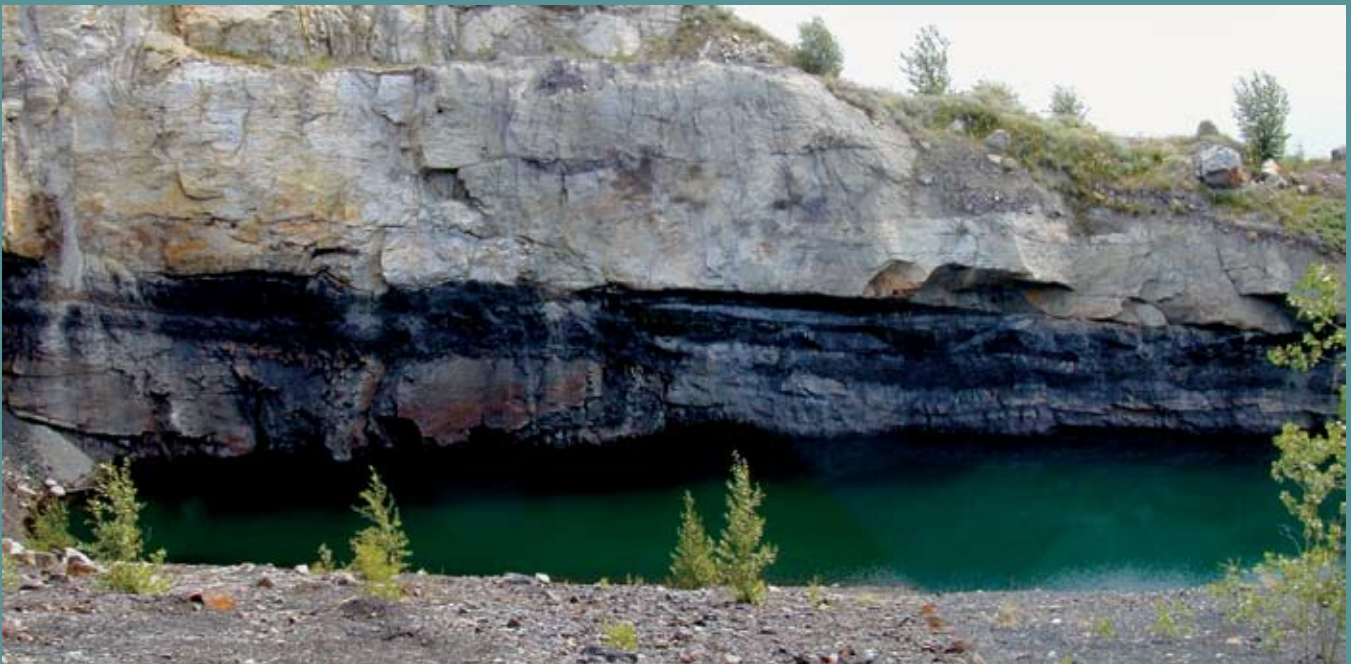
The Whiskey Lake open-pit coal mine in operation in the early 1990s (top) and later view of the upper coal seam (bottom).