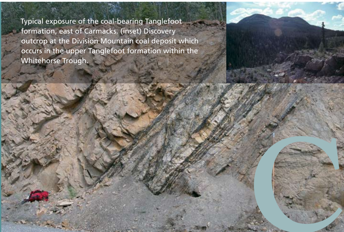
Typical exposure of the coal-bearing Tanglefoot formation, east of Carmacks. (inset) Discovery outcrop at the Division Mountain coal deposit which occurs in the upper Tanglefoot formation within the Whitehorse Trough.