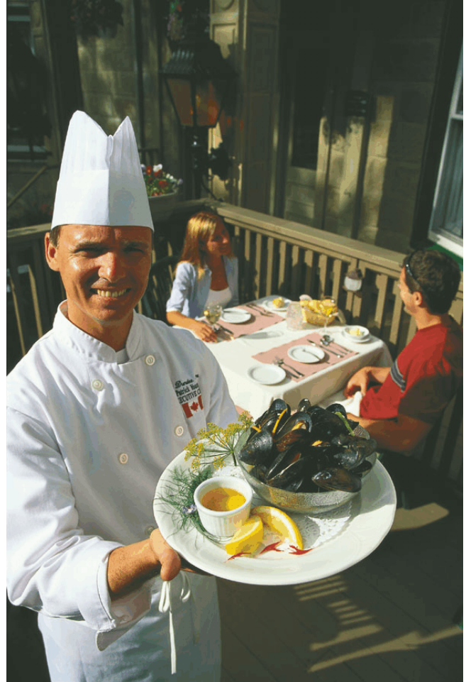
Dundee Arms