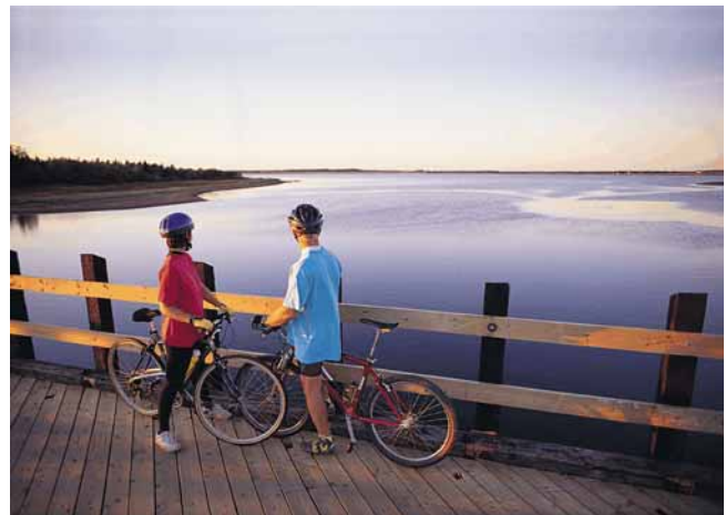
Morell