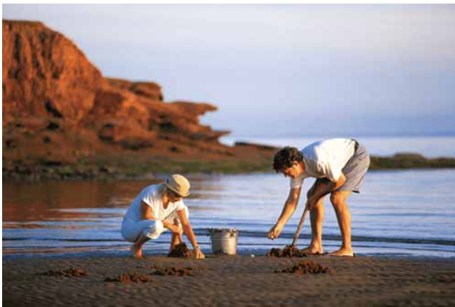
Clam Digging

The Prince Edward Island strategy for tourism competitiveness entitled The New Product Culture was developed in the spring of 2005 and presented to industry at the TIAPEI AGM on November 25, 2005. Although the strategy has only begun to take shape, the Tourism Advisory Council (TAC), Tourism PEI, TIAPEI, ACOA and other industry stakeholders have been working on key action items. This report card will outline both the quantitative and qualitative progress made in 2005.