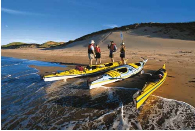
Hog Island, Tourism PEI/John Sylvester