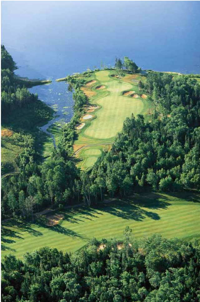
Dundarave Golf Course