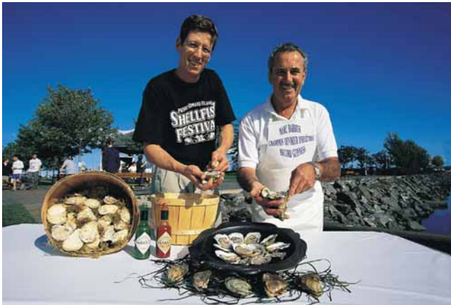
PEI Shellfish Festival, Charlottetown