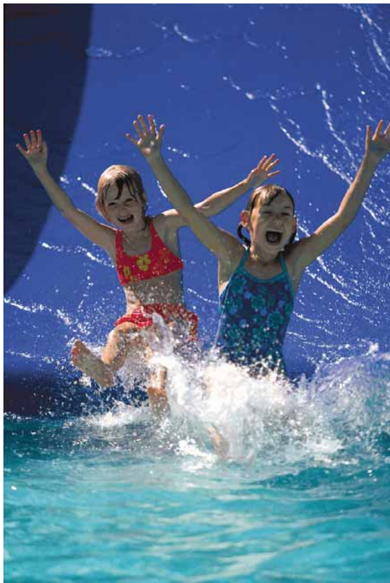
Mill River Fun Park