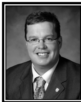
Honourable Alan V. Campbell Minister

A handwritten signature in cursive script that reads "Alan V. Campbell".