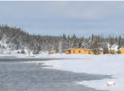
The legendary Jupiter 12 Lodge