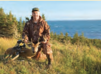
The satisfaction is always as great...