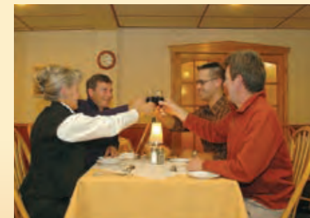
The dining room at Auberge Port-Menier