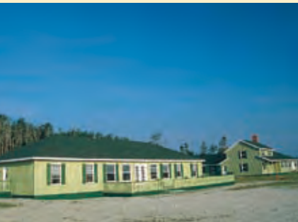
The McDonald Lodge: comfort on the shore