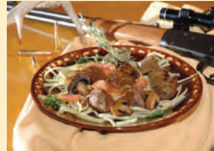
Delicious hearty dishes