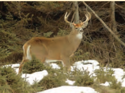
The deer are waiting