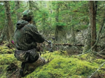
A bow hunter in position