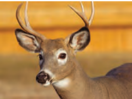
Deer on Anticosti are diurnal and omnipresent