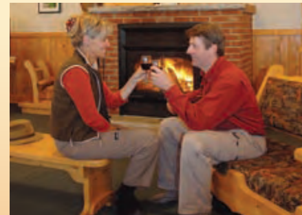
A pleasant interlude after a day of hunting

Kids If your cabin is filled to capacity, a young hunter aged 12 to 17 can join your group and harvest one antlerless deer. The only costs are the hunting license, airfare and meals under the American plan.