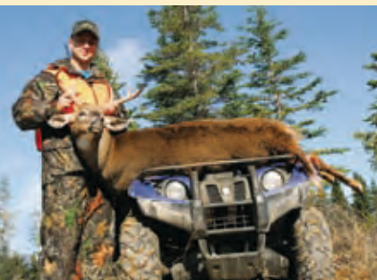
Transportation made easy!