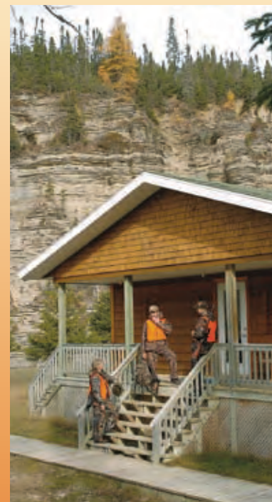
The start of a beautiful day!

Not only that, their isolation protects them from the diseases and ticks often found elsewhere.