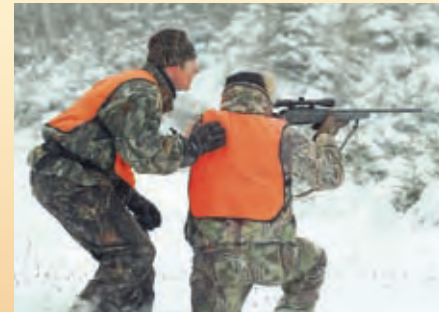
The moment of truth!