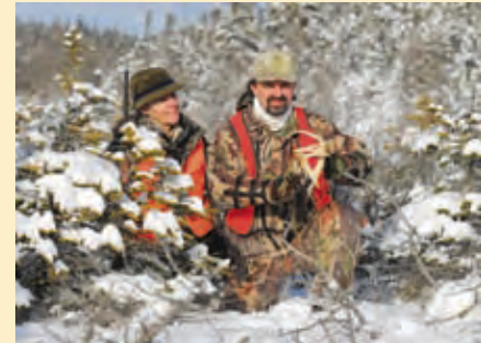
Anticosti, ideal for rattling