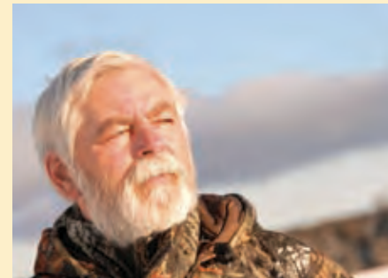
"Anticosti is the perfect place to introduce your grandson to hunting."