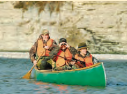
Hunting by canoe on the Jupiter River