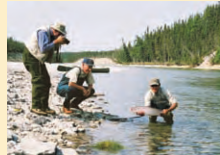
The Jupiter, a generous river