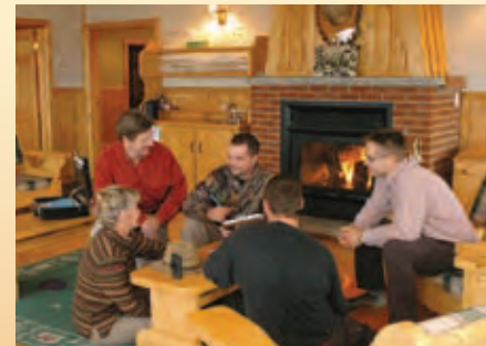
Planning the hunt with your guide