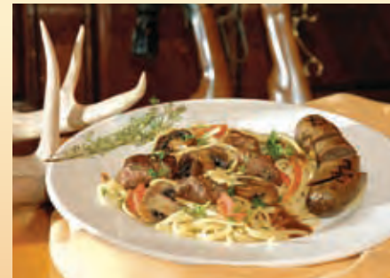
A tradition of culinary excellence