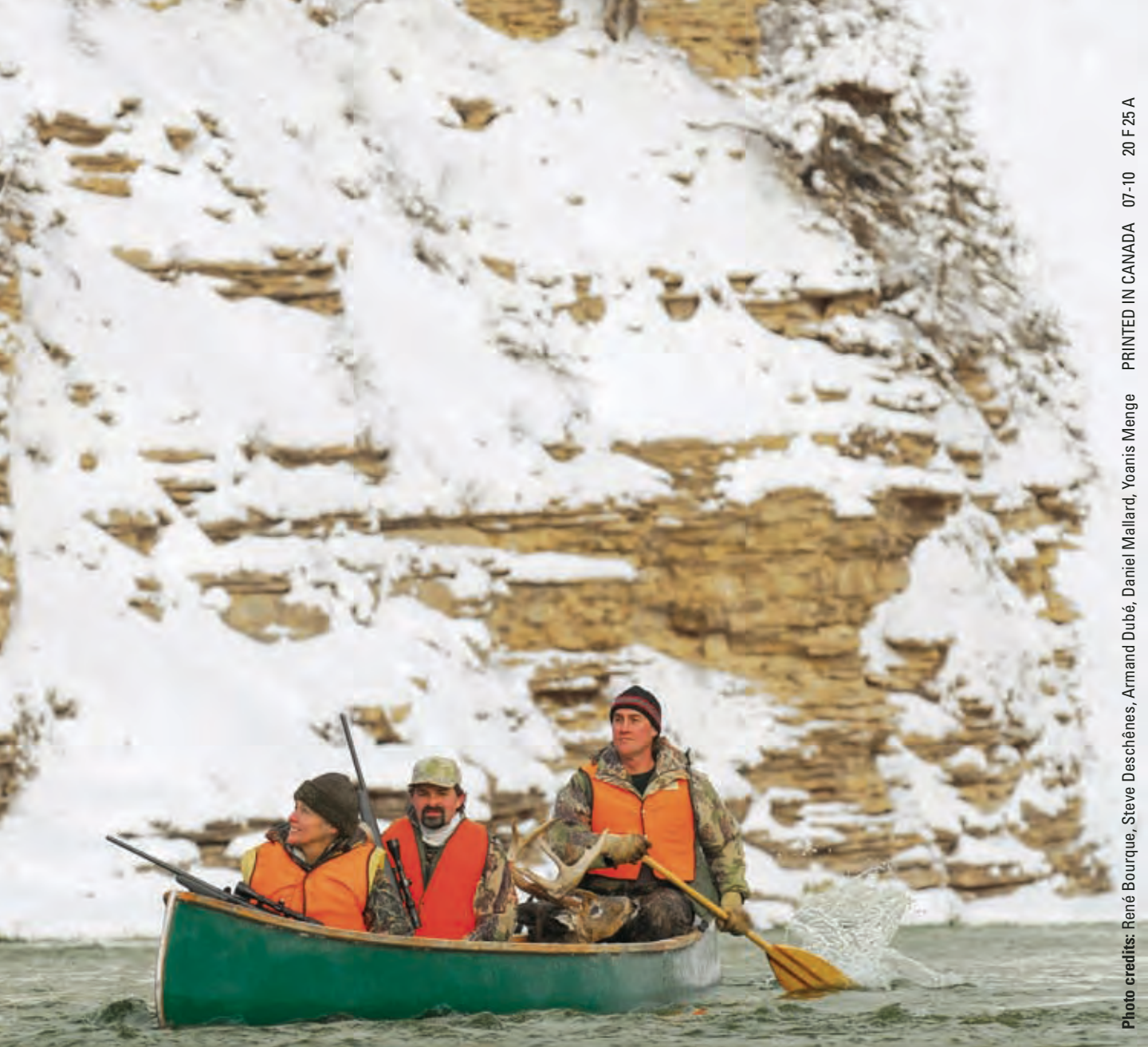
PRINTED IN CANADA 07-10 20 F 25 A