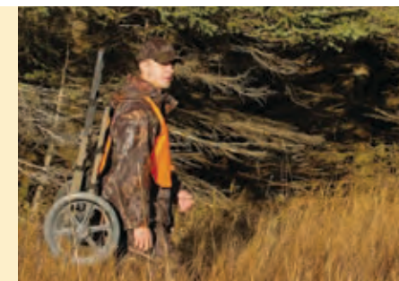
An ingenious system for transporting your kill