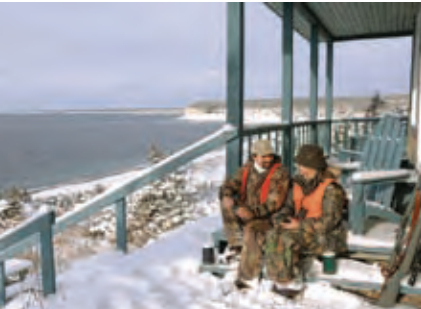
A relaxing moment in an ideal setting