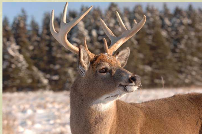
Start planning your trip now.

Anticosti is a whole world to discover for hunters.