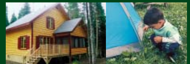
Cabin on the peninsula

Réserve faunique de Matane: (418) 562-3700